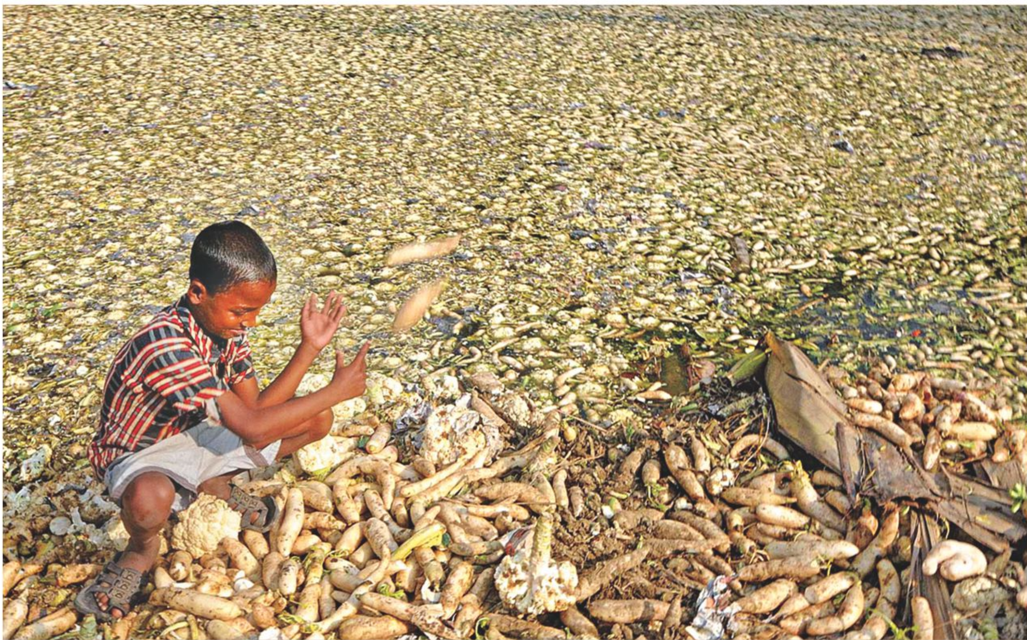
A child throws radishes and cauliflowers into a pond in Mahasthangarh area of Bogra yesterday. Wholesalers, who bought the vegetables, had to dump their goods being unable to sell or ship them to the capital during the opposition called 131-hour blockade.