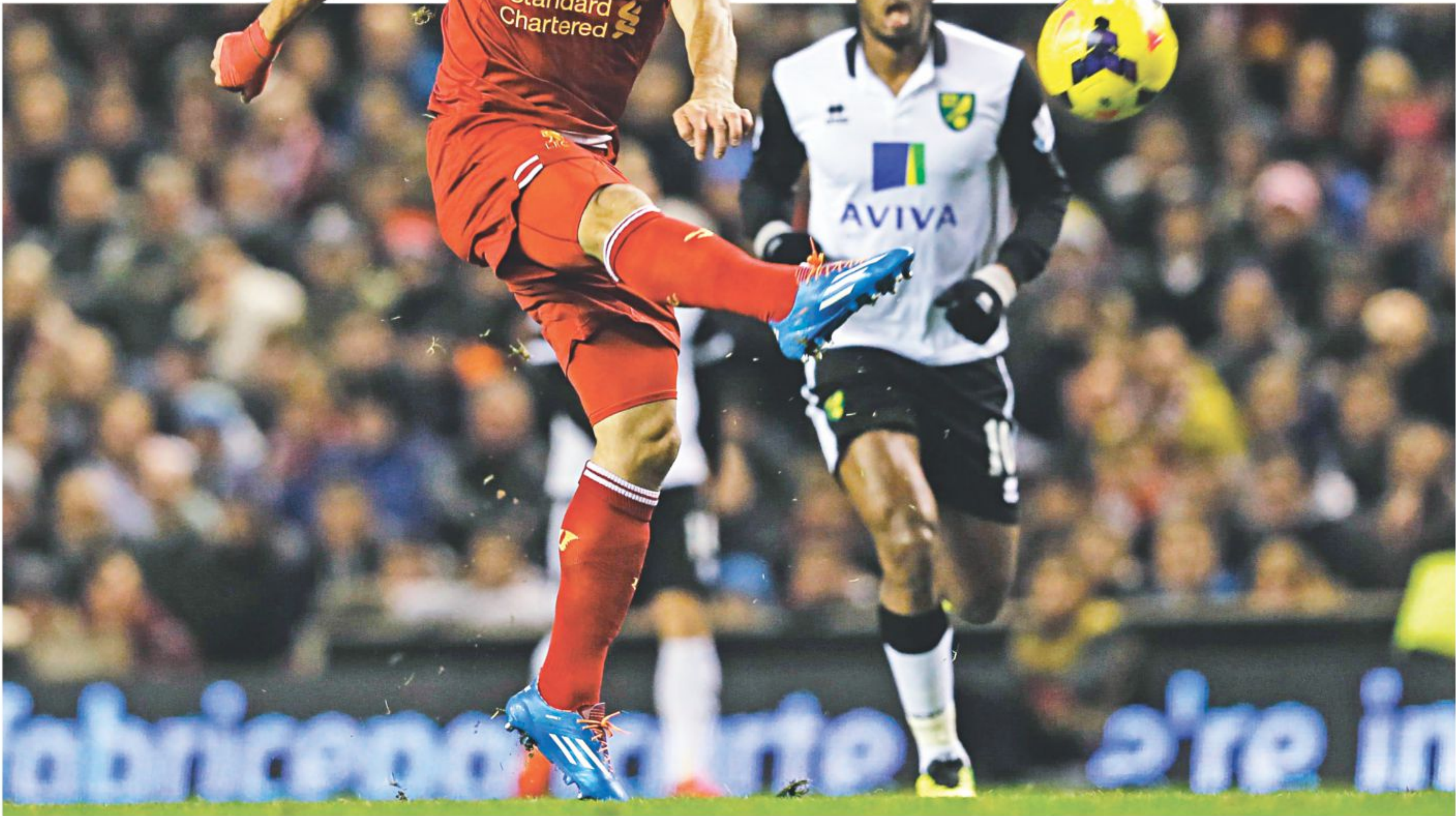
Liverpool striker Luis Suarez (L) opens the scoring with a stunning strike against Norwich during their Premier League encounter at Anfield on Wednesday.