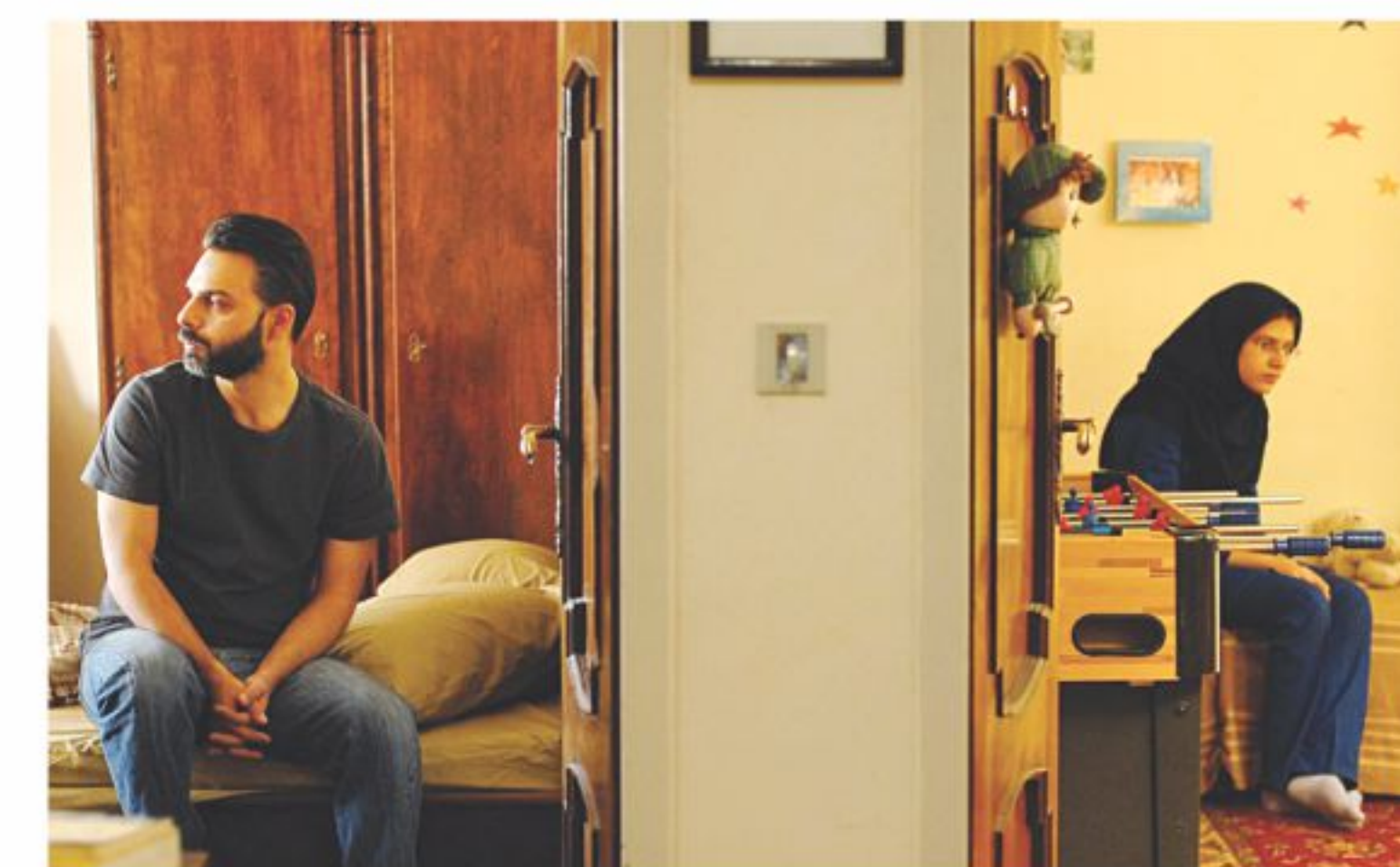
Scenes from the films "A Separation" and "Children of Heaven".