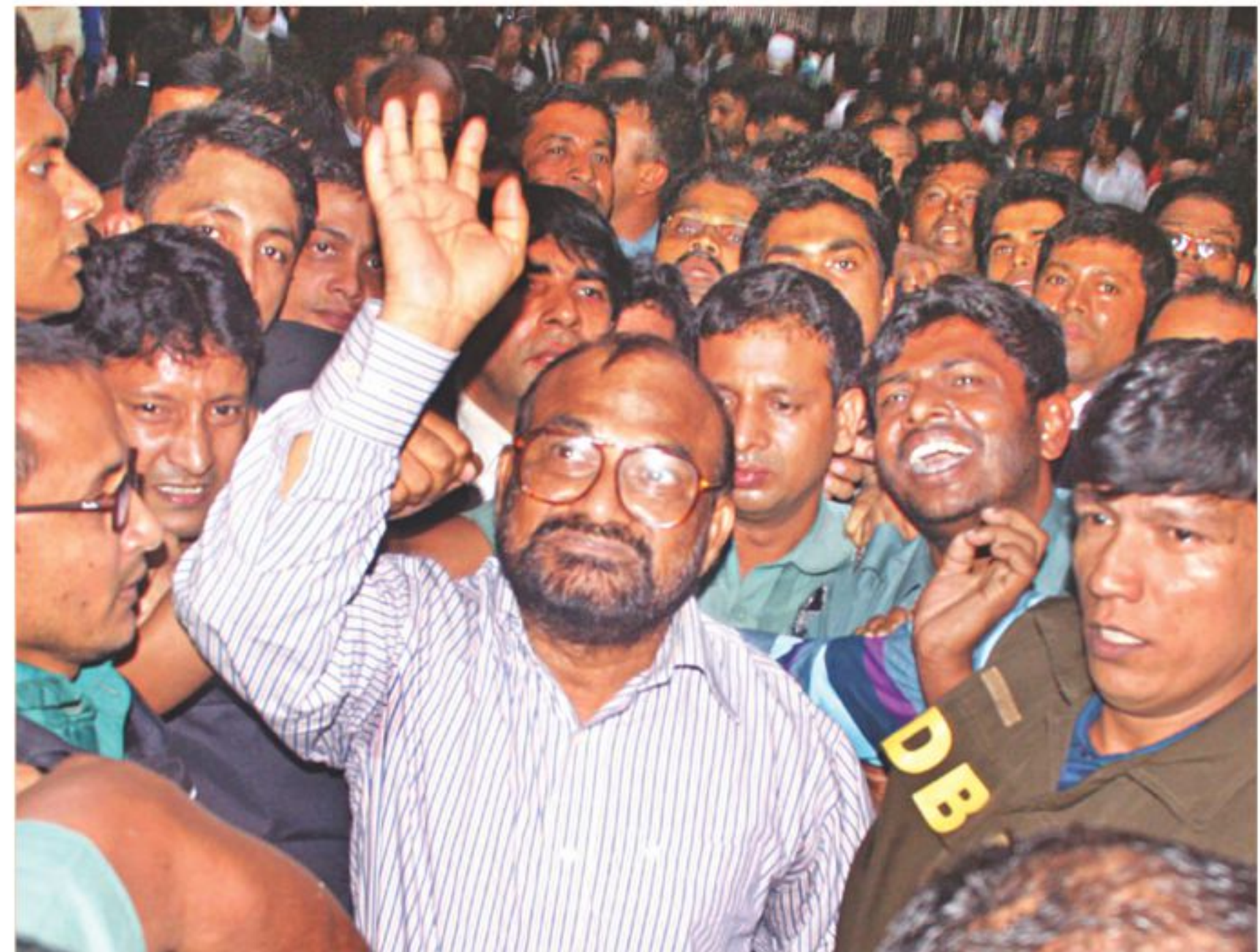
BNP Vice President Sadeque Hossain Khoka waves to party activists and supporters while being taken to a Dhaka court which placed him on a two-day remand yesterday on charges of arson and killing. He was arrested in the capital on Wednesday night.

During the meeting, Tariqat Foundation leaders said general people are not with the so-called movement of the opposition.