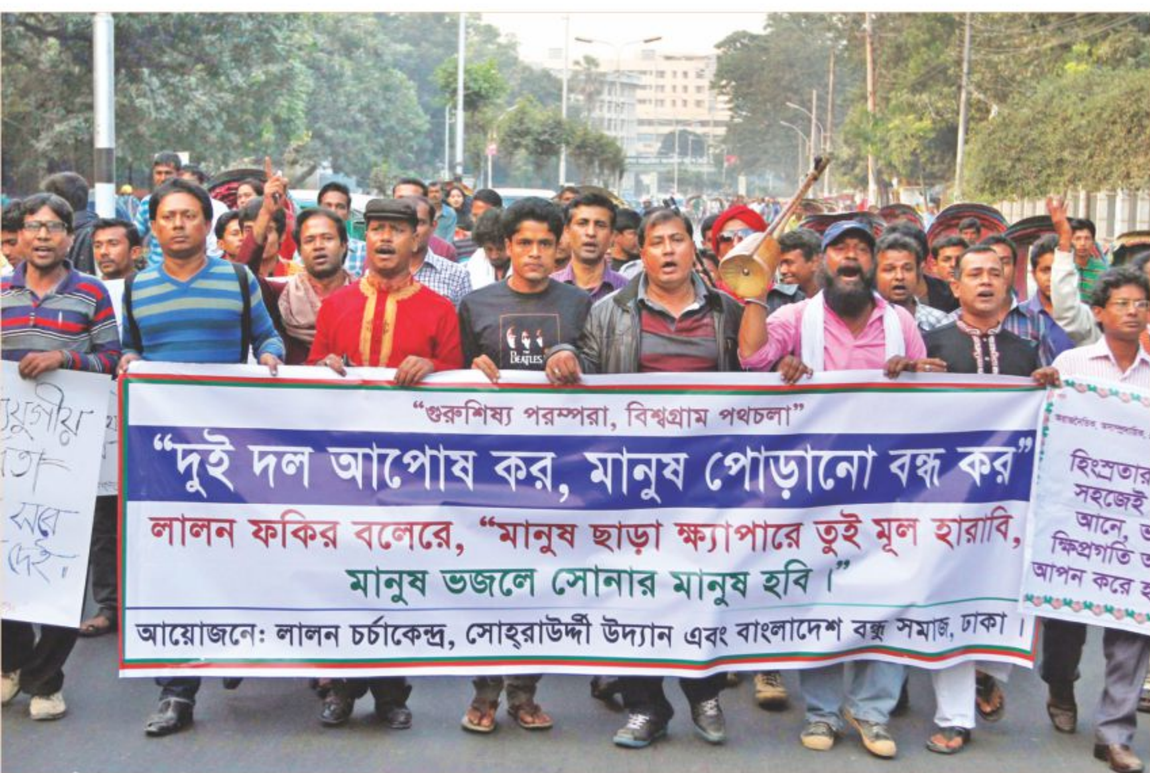
Lalon Charcha Kendro and Bangladesh Bandhu Samaj bring out a procession on Dhaka University campus yesterday demanding a stop to burning of people during political strikes and consensus between the two major parties.