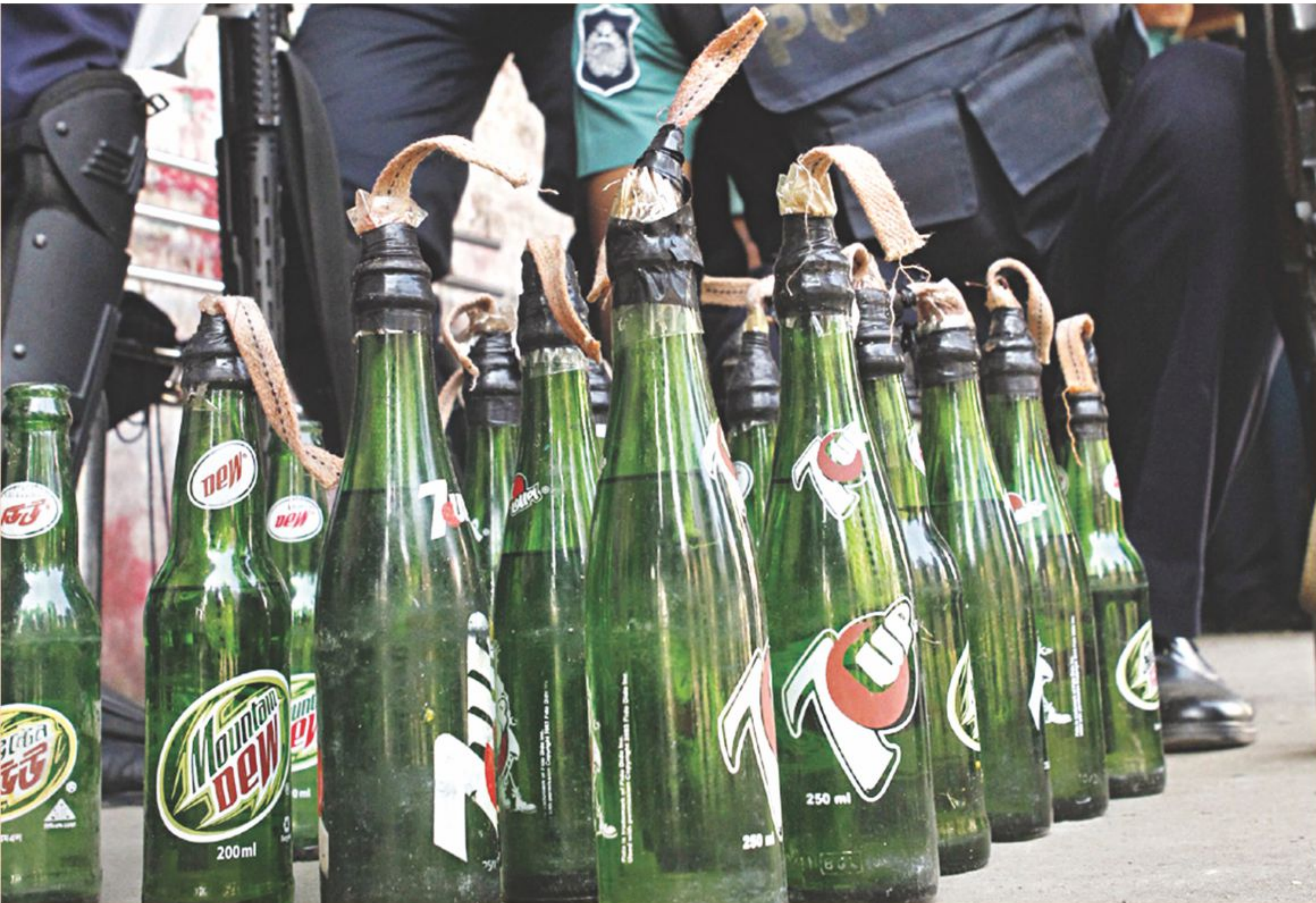
Police seized 20 petrol bombs found abandoned by a ragpicker in the capital's Moghbazar Wireless Gate area yesterday.