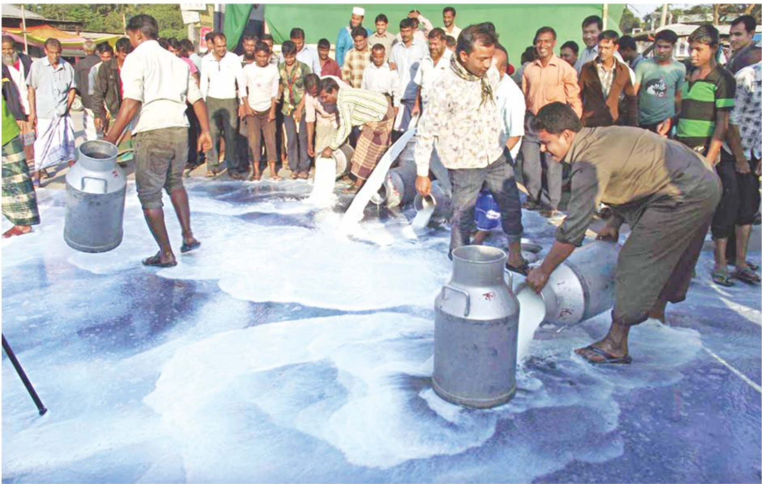
Dairy farmers dump milk on the road at Sat Matha of Rangpur city protesting the opposition-called blockade, which makes them unable to sell or transport the milk, which goes bad.