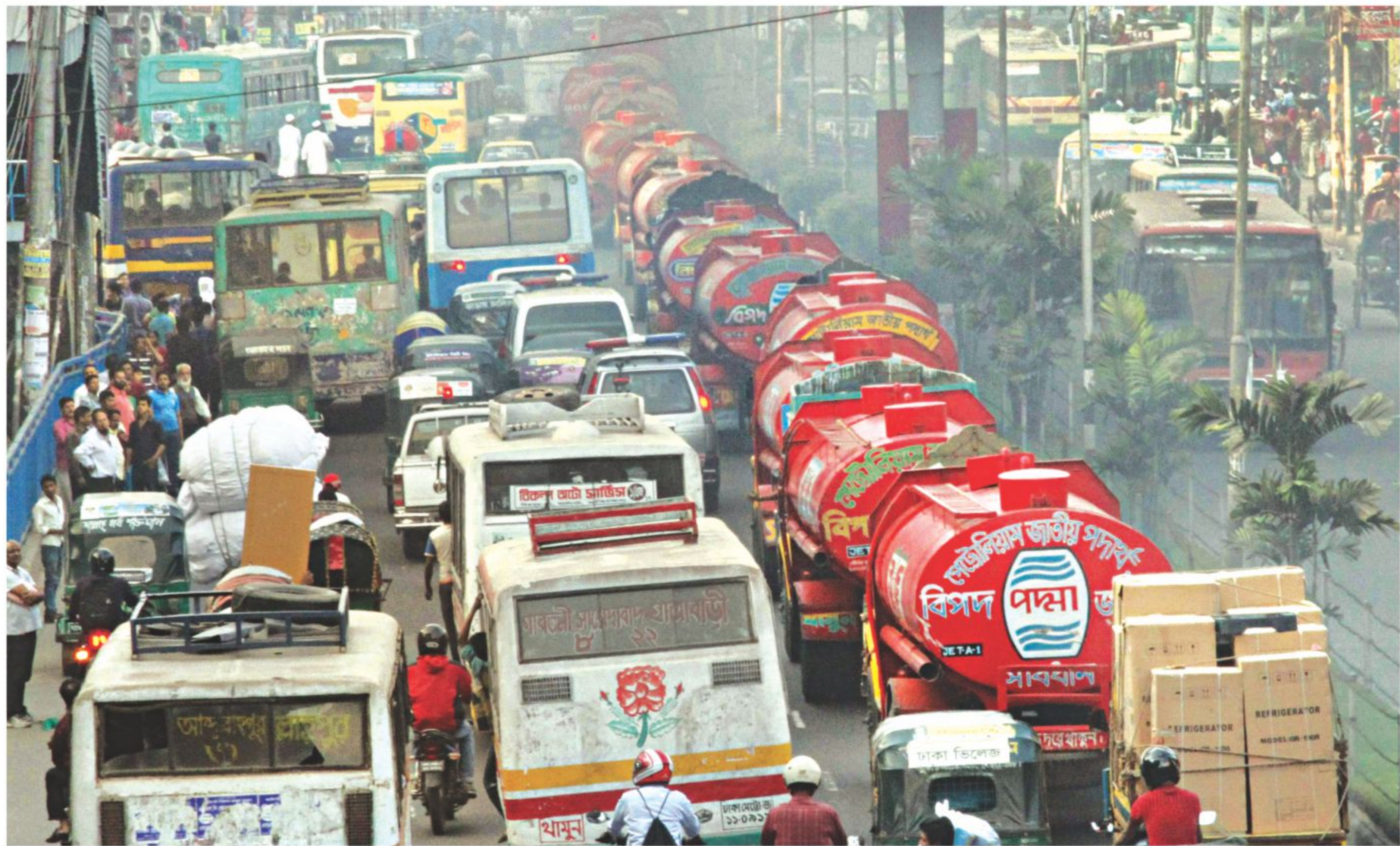
In a convoy, over 100 tankers loaded with jet petrol head towards Shahjalal International Airport in the capital from Narayanganj during the opposition's blockade yesterday. Every day just enough fuel is taken to the airport in this way to ensure a smooth operation of flights. The photo was taken at Farmgate.