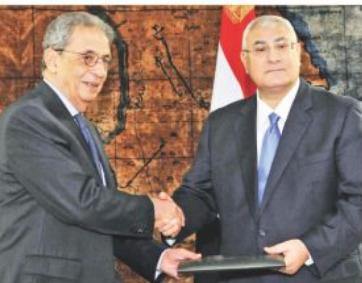
Egypt's interim president, right, receives the draft constitution

states that "no civilian can be tried by military judges, except for crimes of direct attacks on armed forces, military installations and military personnel."