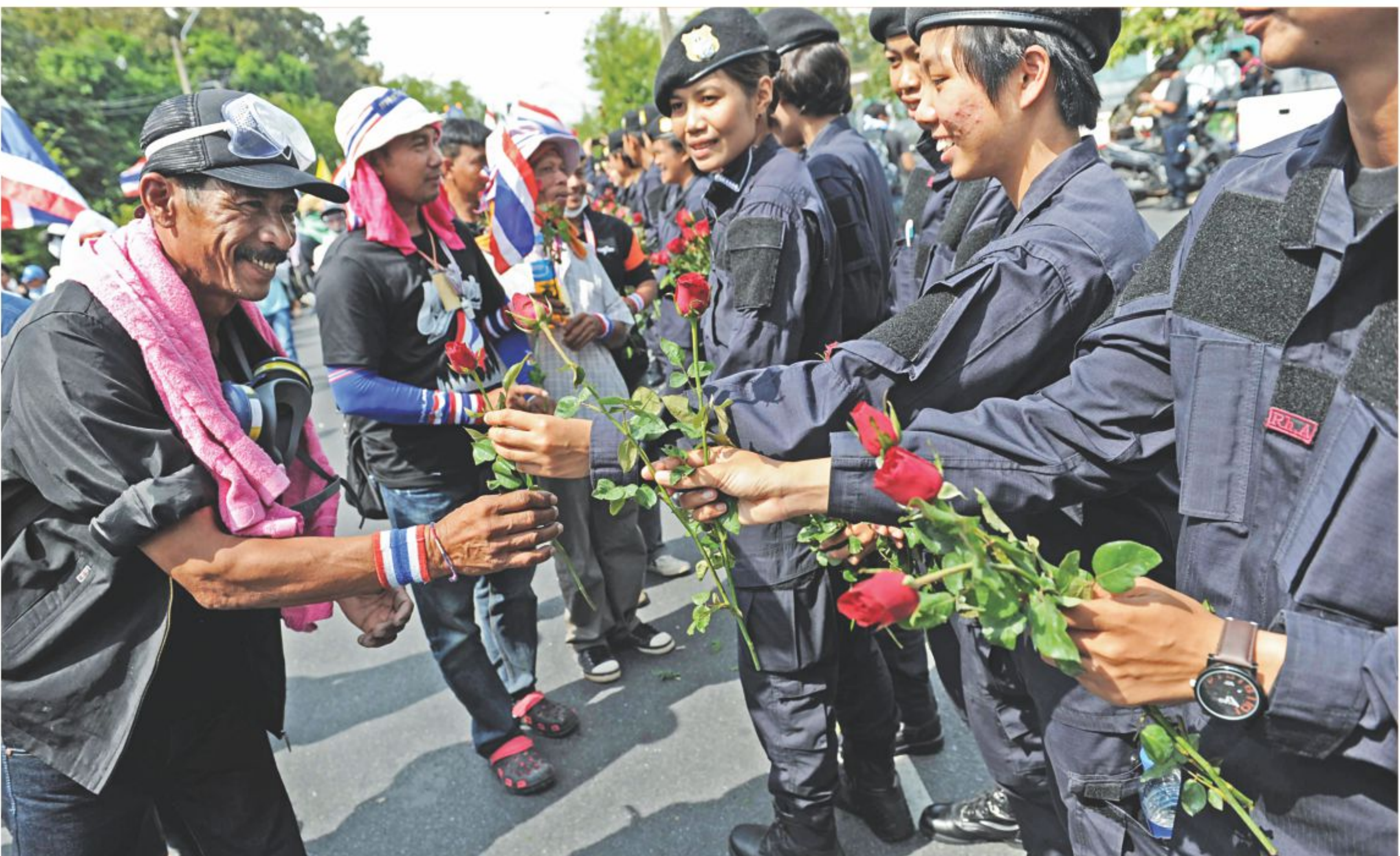
Thai anti-government protesters greet and receive flowers from policewomen after police lifted barricades in Bangkok, yesterday. Protesters responded with cheers and applause, claiming victory. Some of them hugged police officers and took photos with them.