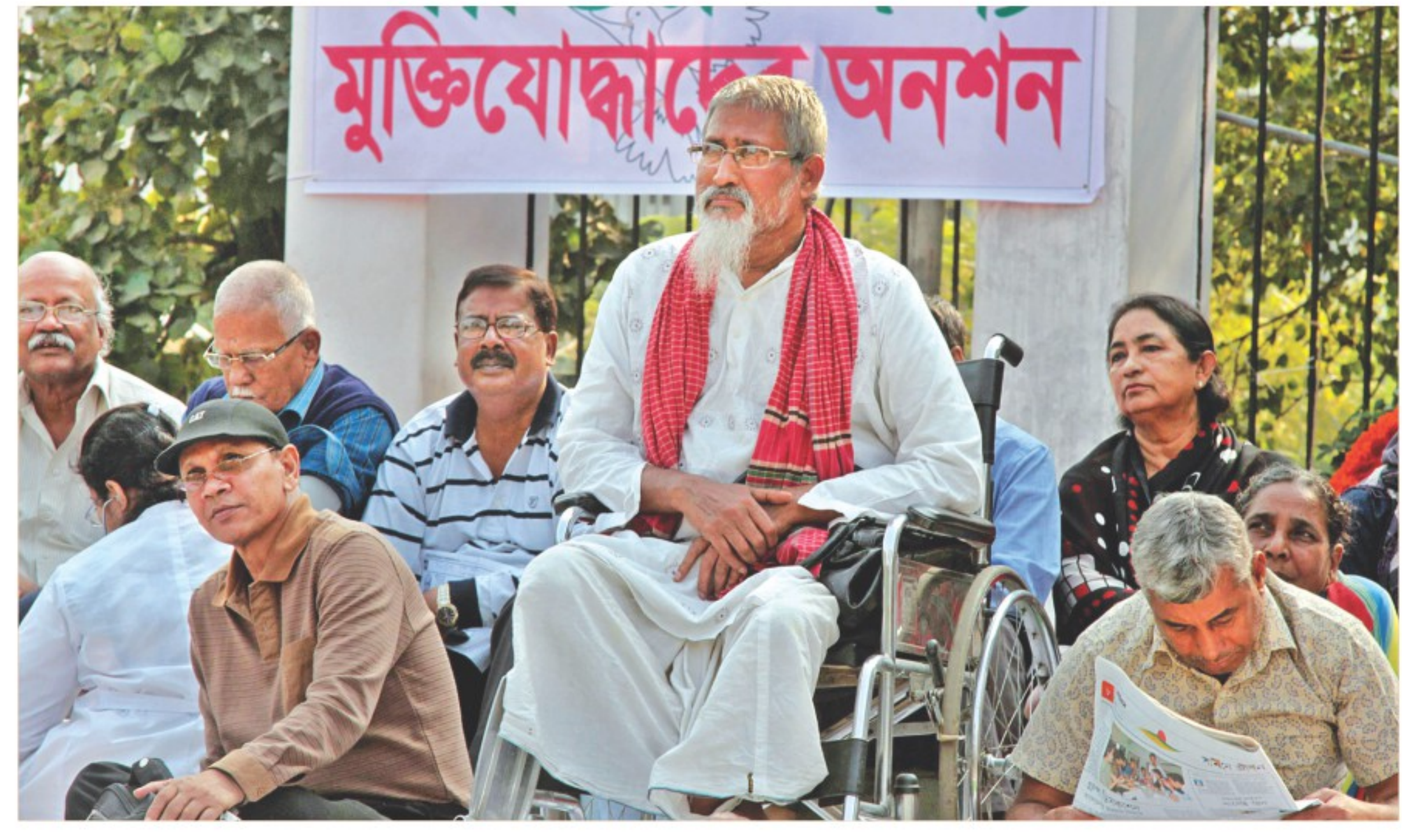
Freedom fighters at Central Shaheed Minar in the capital yesterday on the second day of their three-day hunger strike that began on Monday seeking peace in the country as political violence is going on ahead of the parliamentary elections.