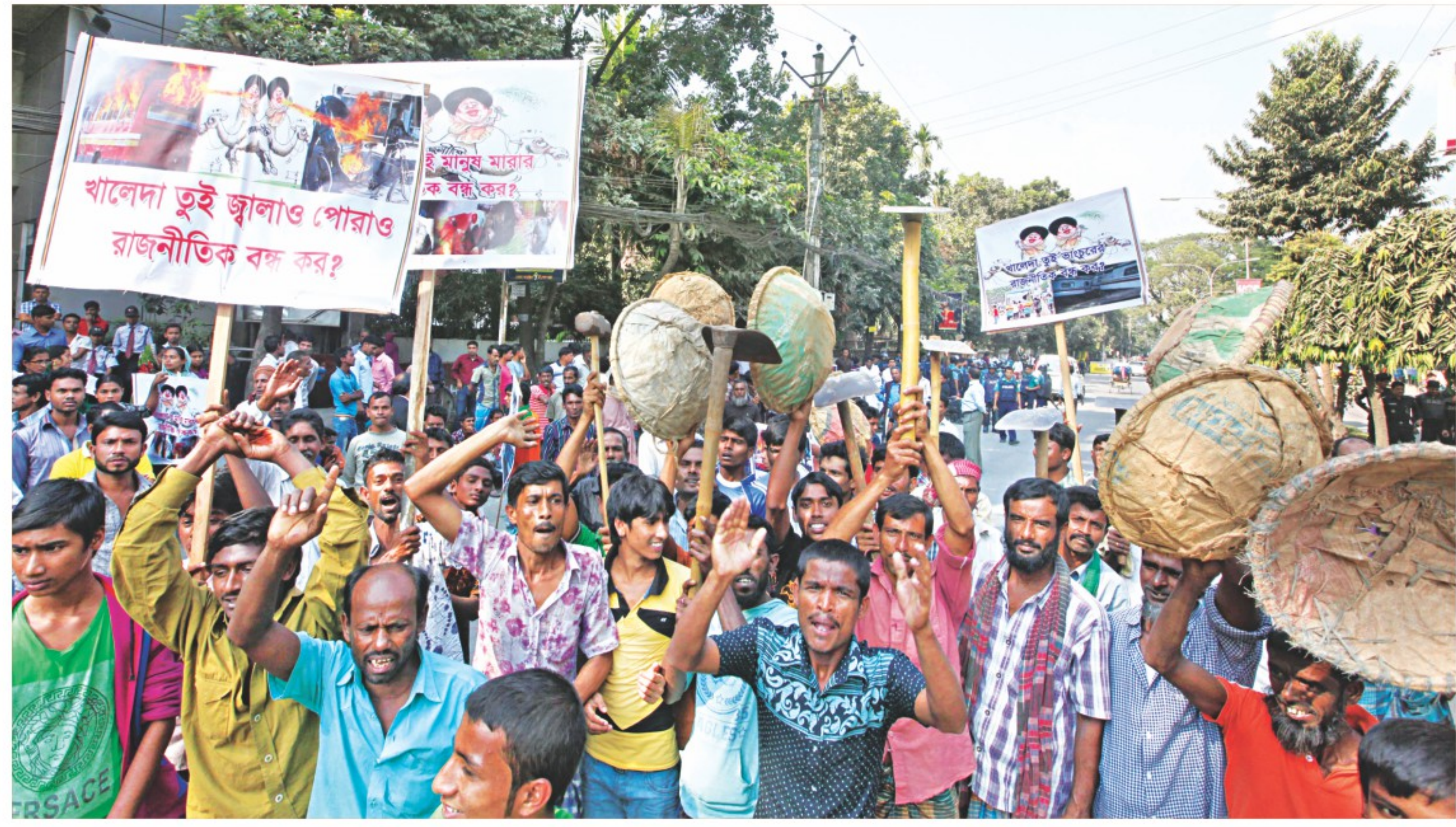
Several hundred day labourers under the banner of "Khet Khawa Manush" on their way to Kheda Zia's residence in the capital yesterday with the demand that the BNP chief abandon the tactic of blockades and hartal as a form of protest. Police intercepted the labourers at Gulshan-2 intersection preventing them from reaching Kheda's house.

With the opposition's ongoing movement hitting hard the lives and livelihoods of the low income people, several hundred day labourers yesterday tried to stage demonstrations in front of BNP Chairperson Kheda Zia's residence in the capital. Law enforcers, however, foiled the bid of the protesters who demand that the BNP chief abandon the tactic of blockades and hartals as a form of protest. A day ago, police foiled a procession of transport workers who tried to stage dem-