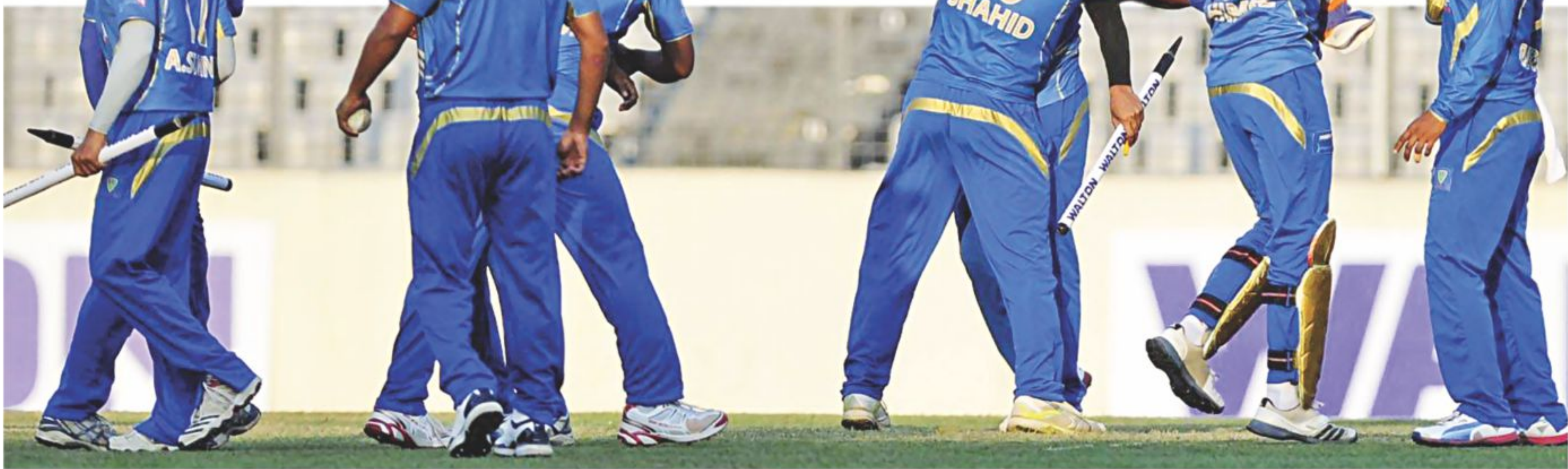
Gazi Tank players celebrate becoming champions after the fall of the last Prime Doleshwar wicket during the Dhaka Premier League match at the Sher-e-Bangla National Stadium in Mirpur yesterday.

The match held at Manikganj district football stadium saw Dashora going 4-0 up before halftime and making it 5-0 just seven minutes into the second half.