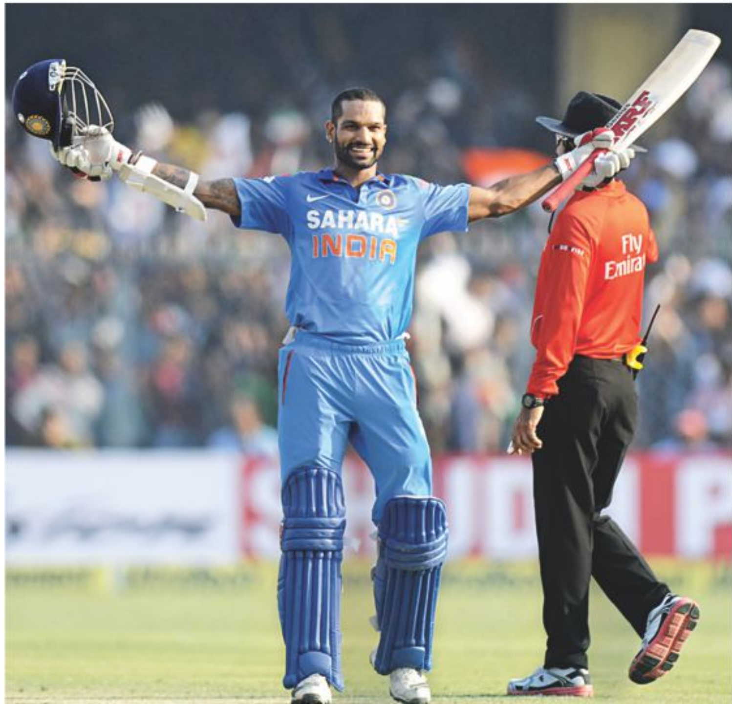
India opener Shikhar Dhawan spreads his arms in celebration after reaching a hundred against West Indies in their third and deciding ODI in Kanpur yesterday.