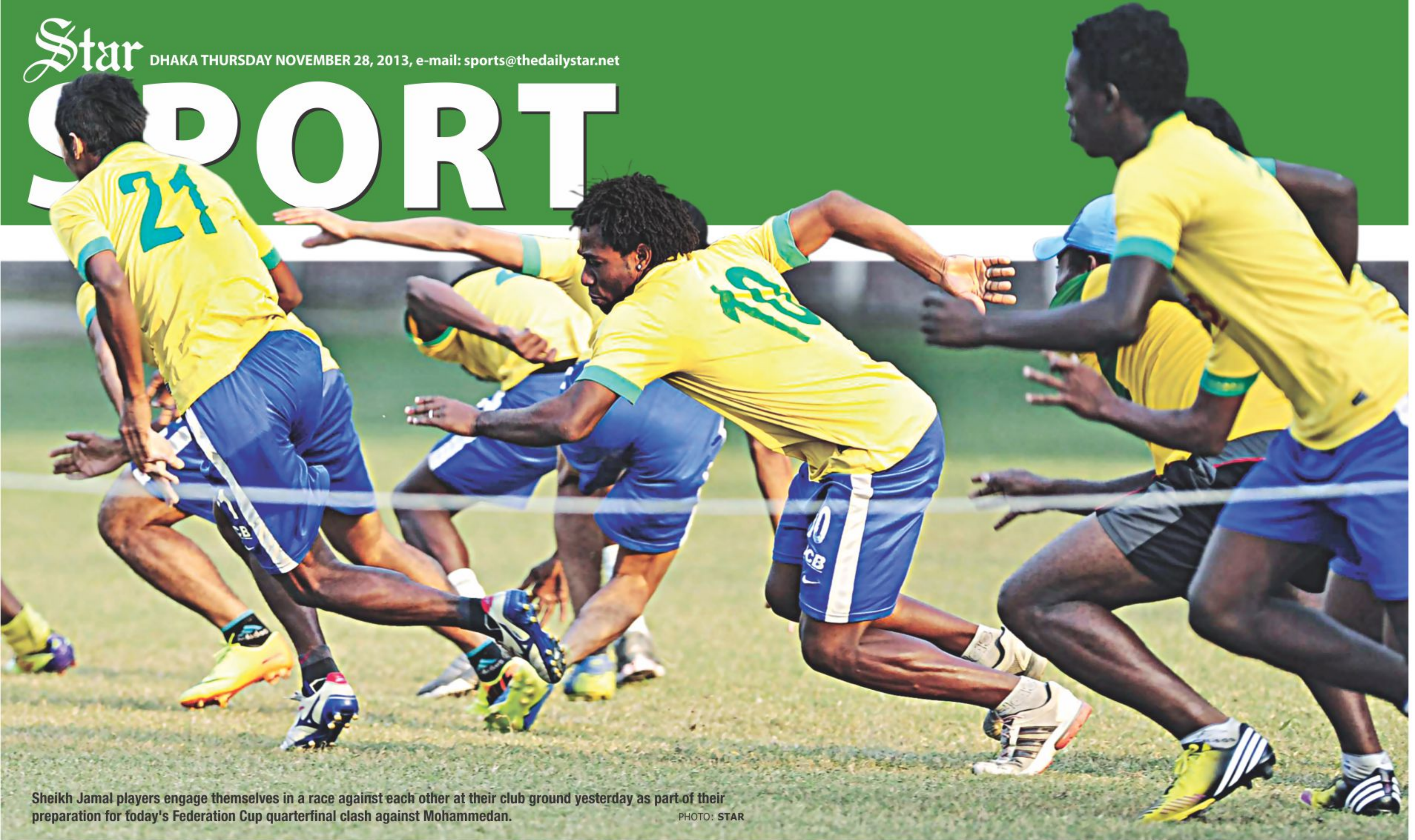
Sheikh Jamal players engage themselves in a race against each other at their club ground yesterday as part of their preparation for today's Federation Cup quarterfinal clash against Mohammedan.