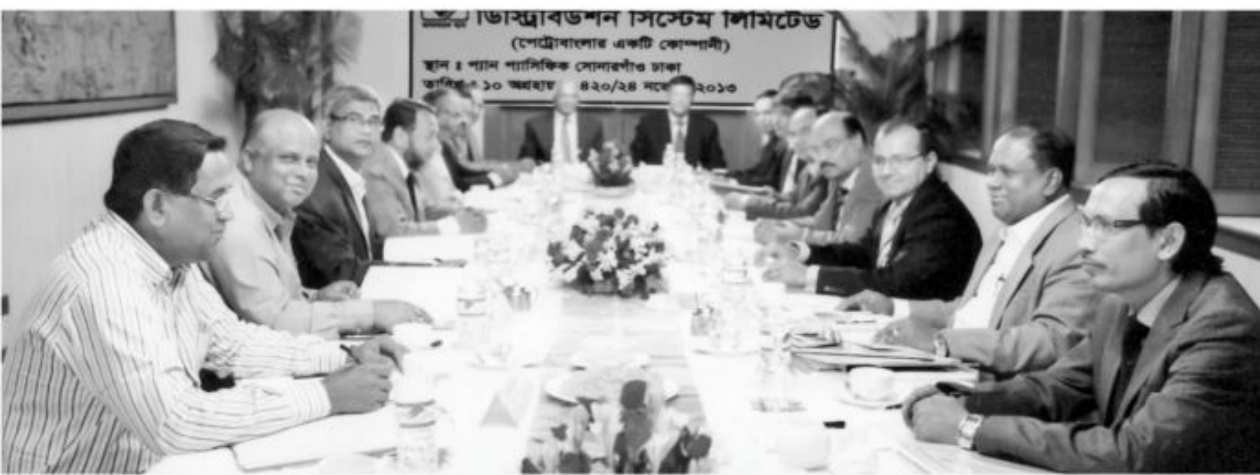
JALALABAD GAS T AND D SYSTEM

"Importantly, we will also be able to track and discuss Bangladeshi efforts. This is an important priority for the US as Bangladesh seeks to prevent more tragedies in its RMG sector," he added.