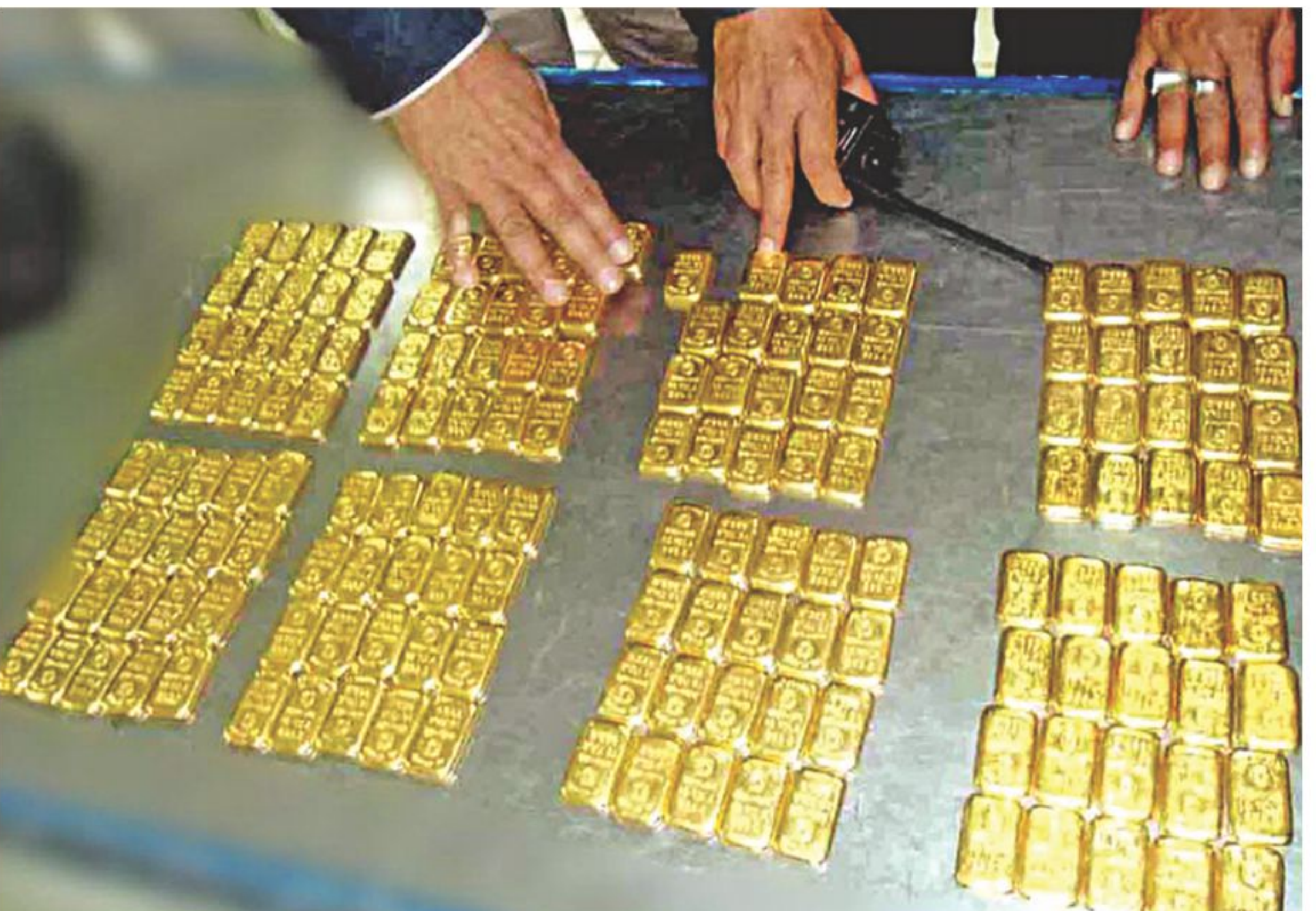
One hundred and sixty smuggled gold bars, weighing 27kg and worth about Tk 8 crore, seized by customs officials from a toilet bin of a Regent Airways flight from Malaysia, which arrived at Hazrat Shahjalal International Airport in the capital yesterday.