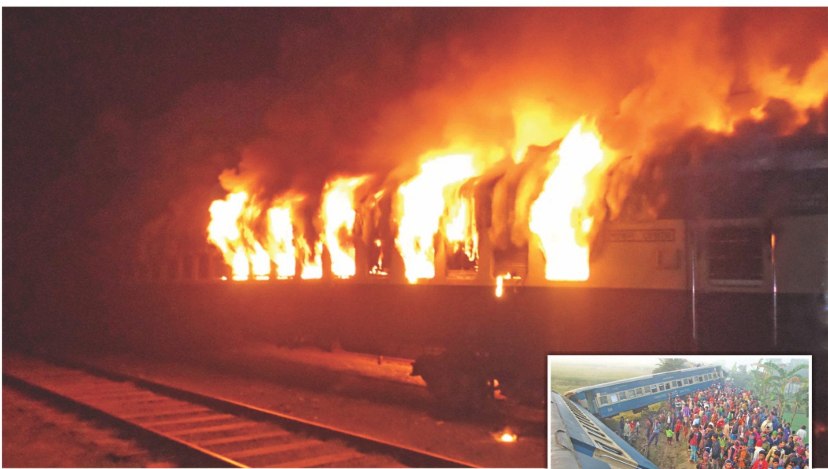
Opposition activists torch the Sirajganj Express at Ishwardi Railway Station at 3:00am yesterday, three hours before their nationwide blockade began. They also removed the sleeper clips from a rail line in Mymensingh causing a train to derail.

The pro-blockade activists yesterday went on the rampage in several districts, vandalising and