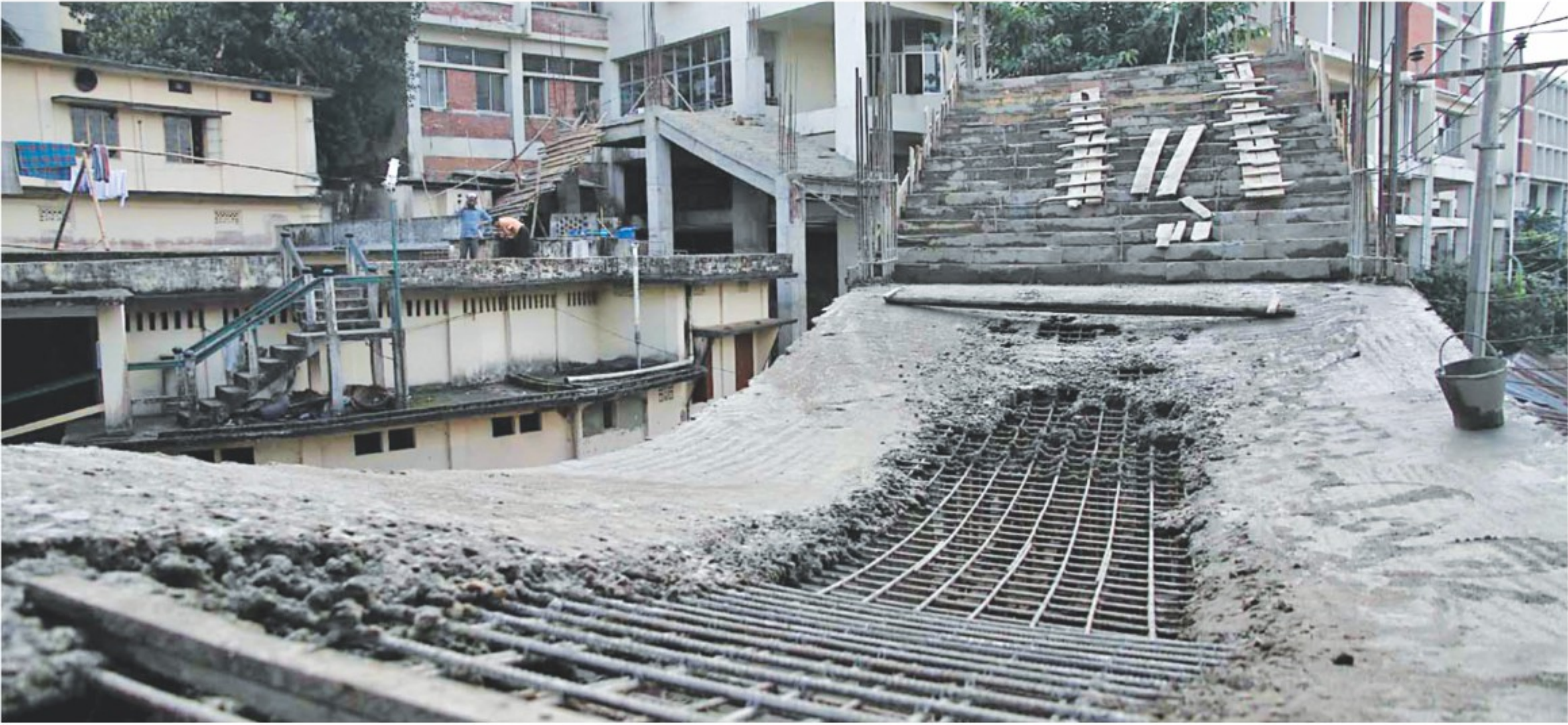
The scaffolding of this under-construction footbridge on the Chittagong court building premises collapsed dropping chunks of concrete on the people underneath. Several people were injured.