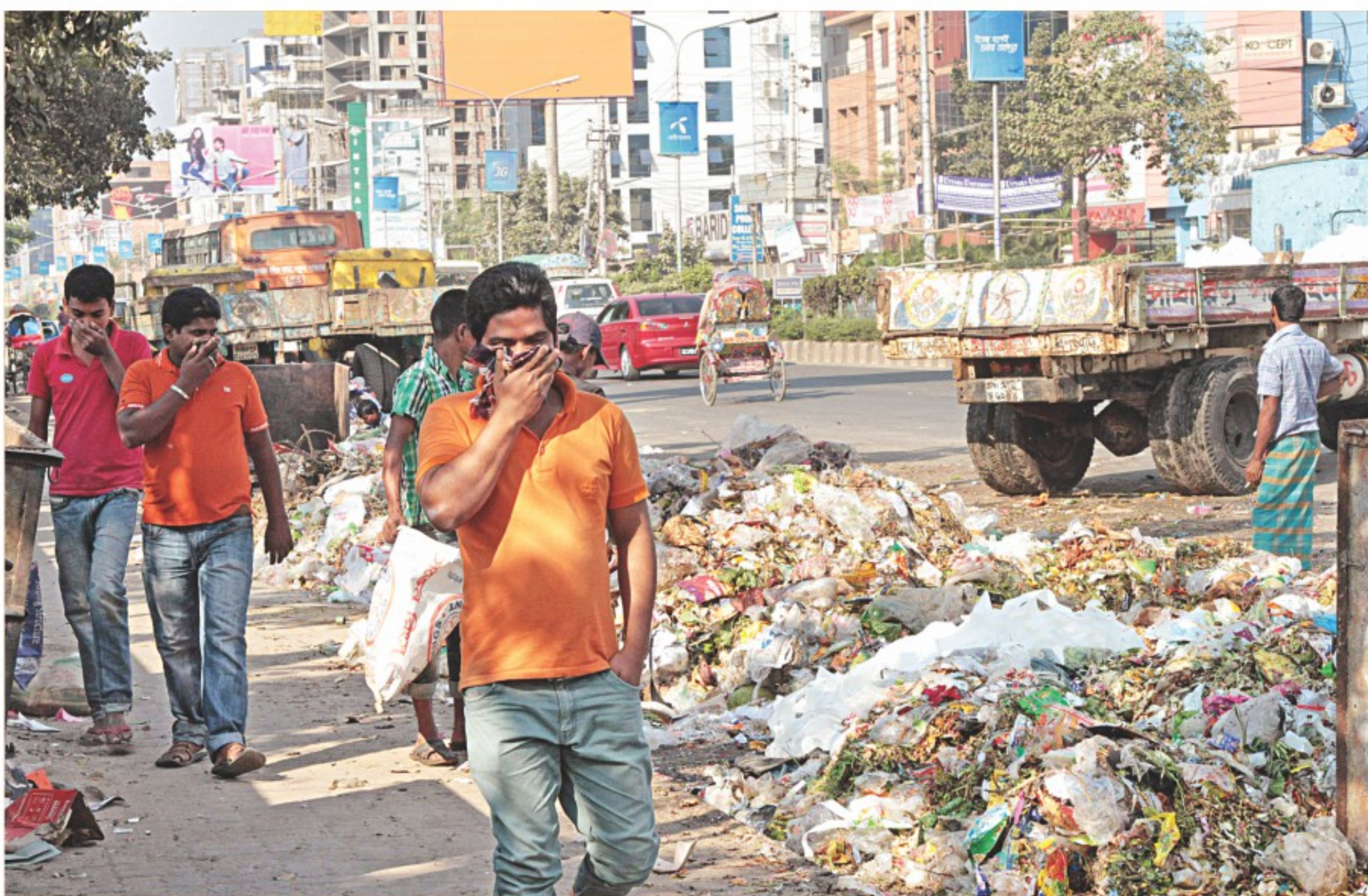
Pedestrians resort to their handkerchiefs and hands passing by this spot in the capital's Notun Bazar yesterday which has been turned into a garbage collection point by Dhaka North City Corporation.