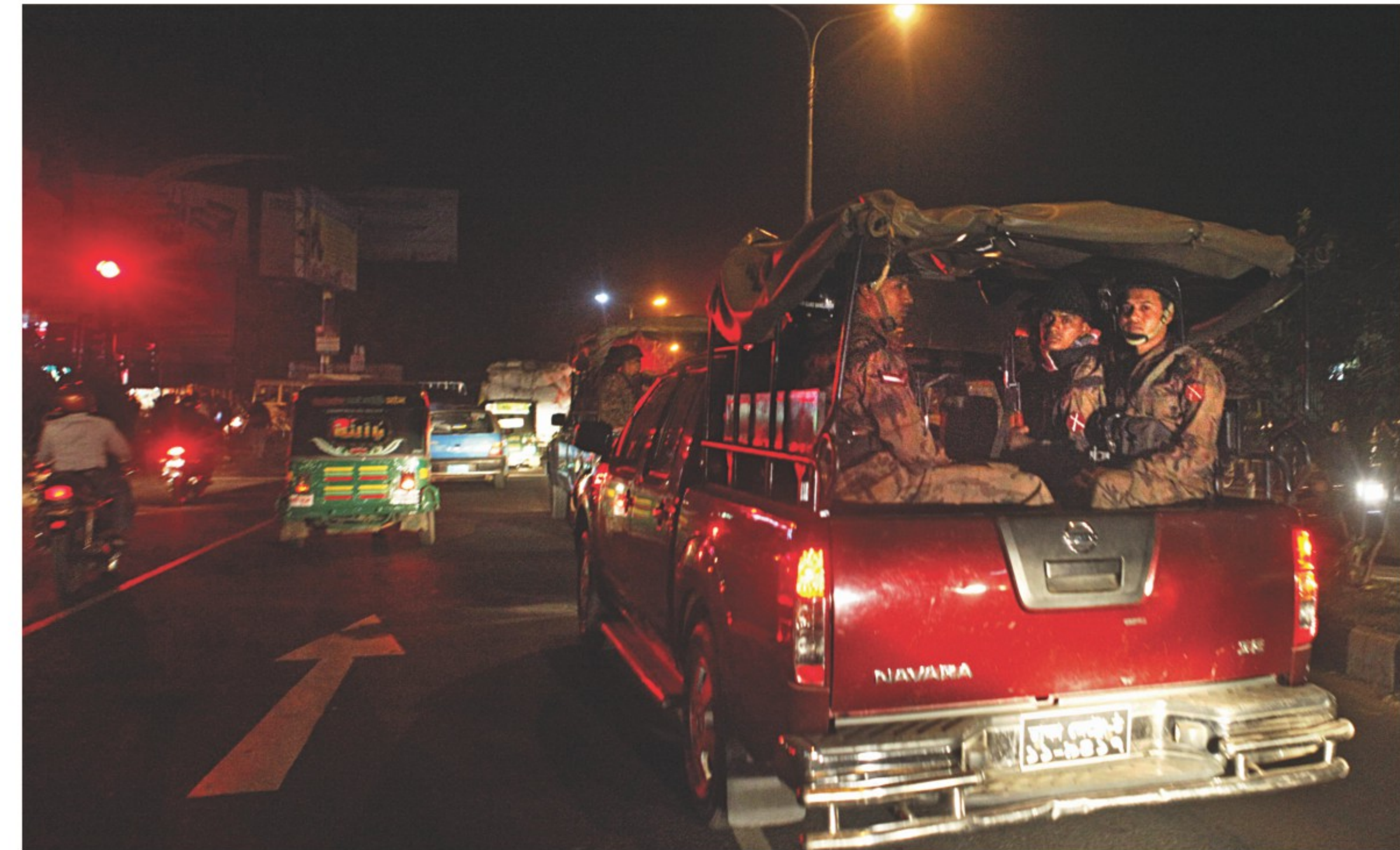
Patrol teams of Border Guard Bangladesh (BGB) at the capital's Shahbagh around 8:30pm last night, shortly after the election schedule was announced by the chief election commissioner. The deployment aims to stave off violence ahead of the poll when the opposition, rejecting the schedule, called a 48-hour road-rail-waterway blockade beginning 6:00am today.