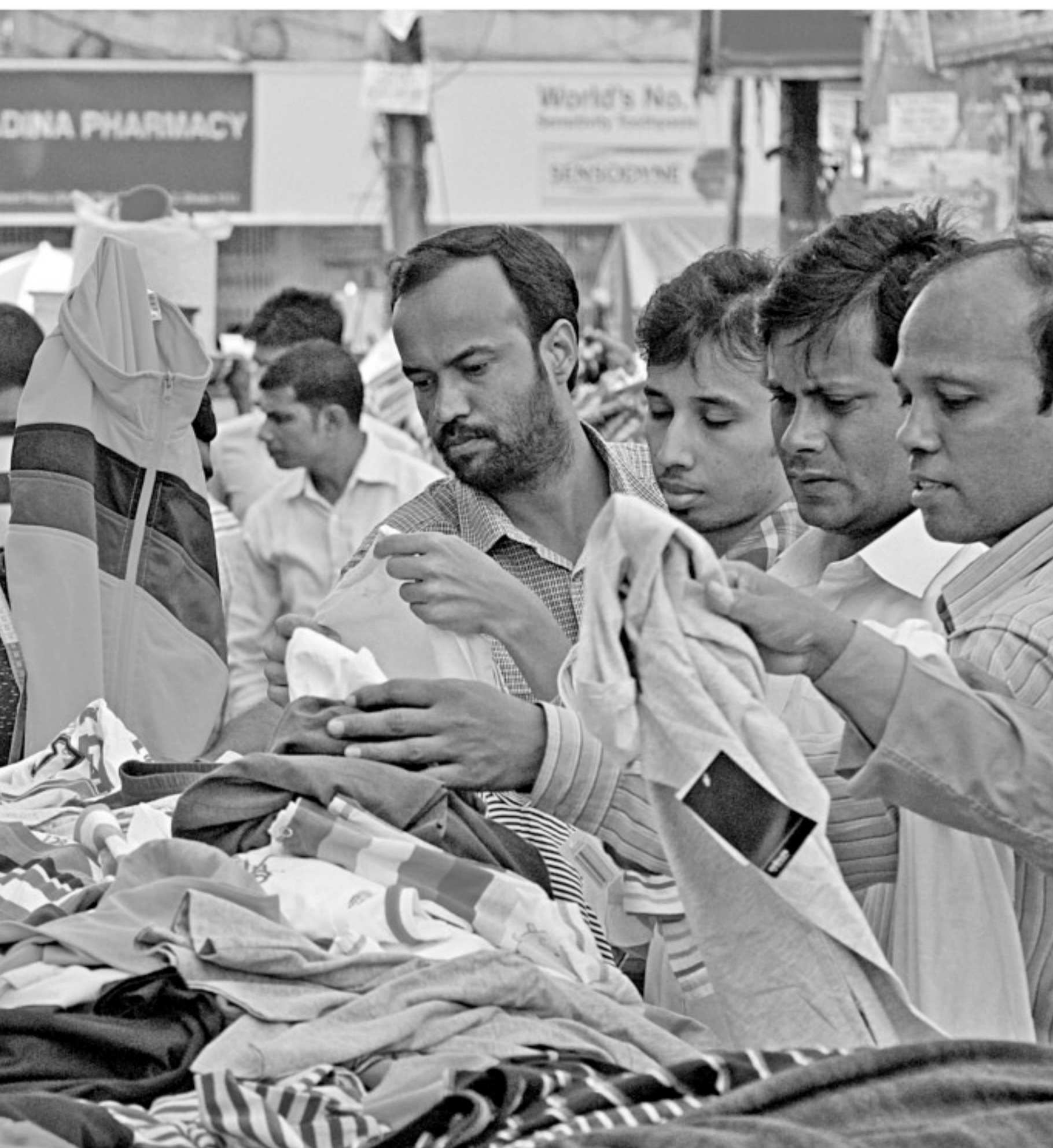
With temperature dropping considerably during the night, people of the low income bracket search for suitable warm clothing to counter the slow but sure approach of winter at a makeshift shop on a footpath in the capital's Gulshan yesterday.