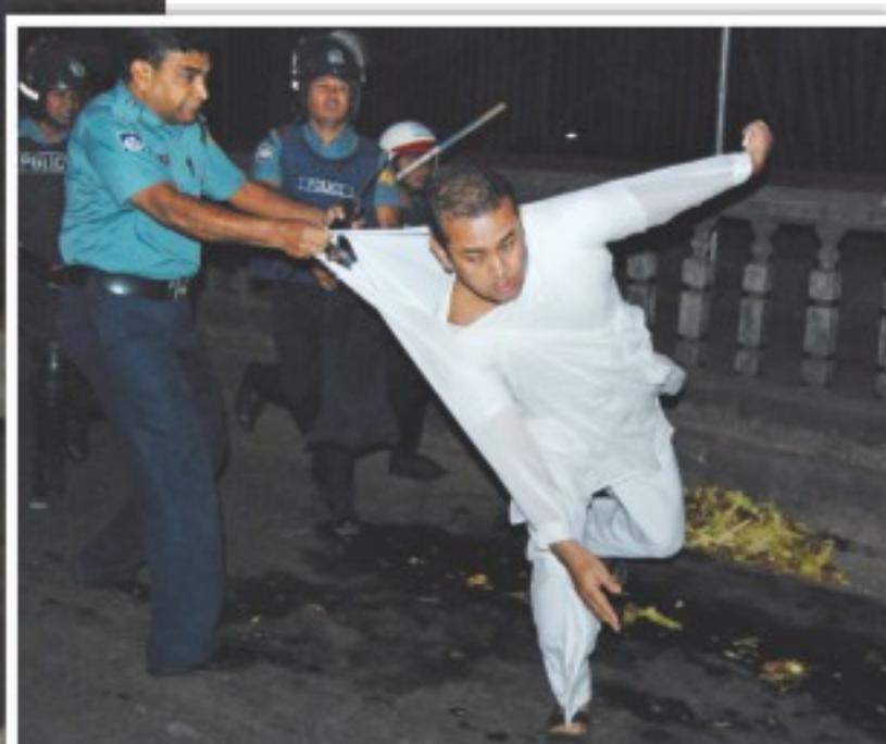
Law enforcers' excess on a Jatiyatabadi Nagorik Dal activist yesterday evening after a procession of the pro-opposition body broke through a police barricade near Ramna Park towards the end of the opposition rally at Suhrawardy Udyan in the capital.