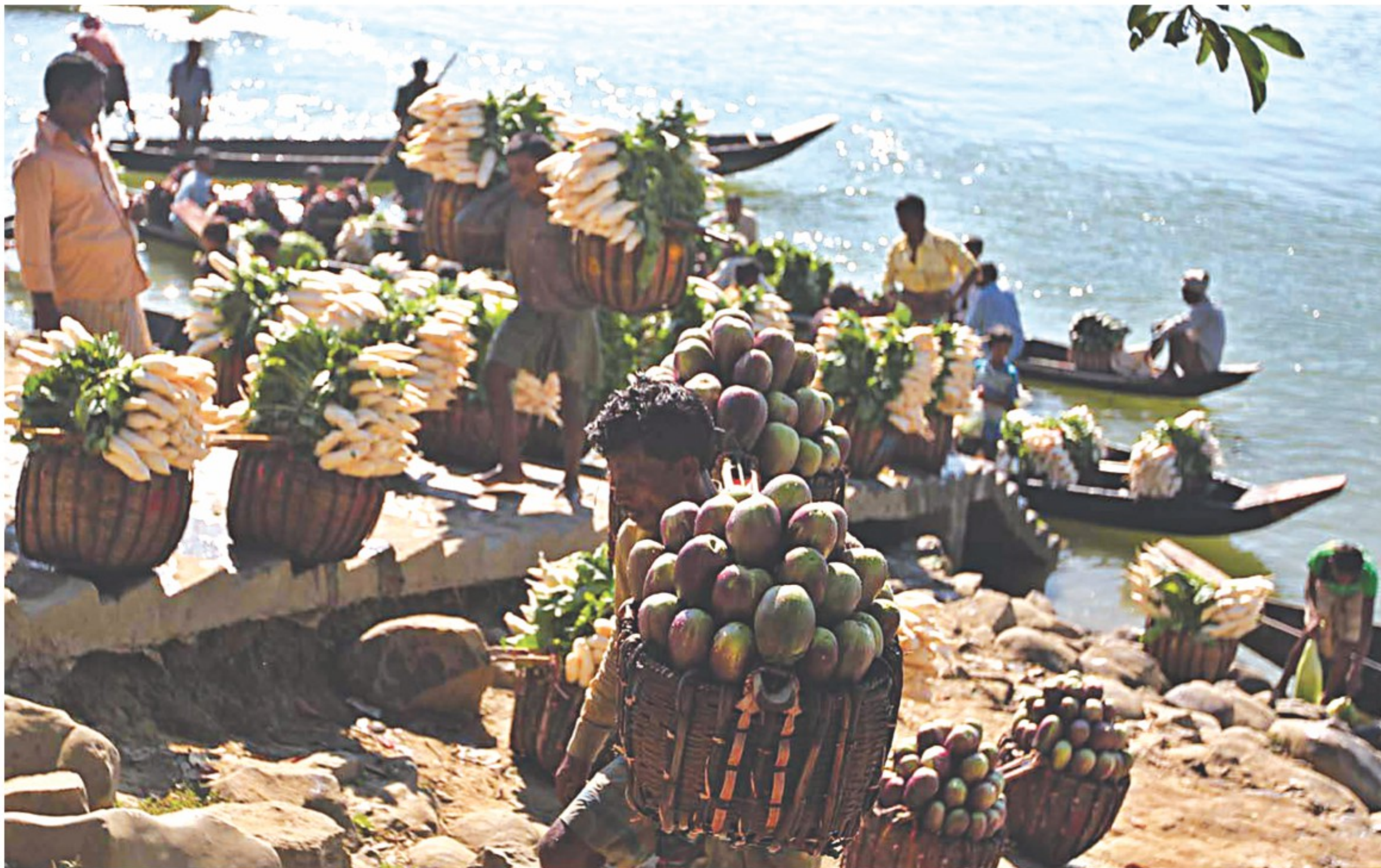
Winter vegetables grown on the banks of the river Shankha pour into the Dohajari Railway Station Bazar in Chittagong on boats every day just after dawn. The vegetables the farmers sell here end up at kitchen markets in the port city.