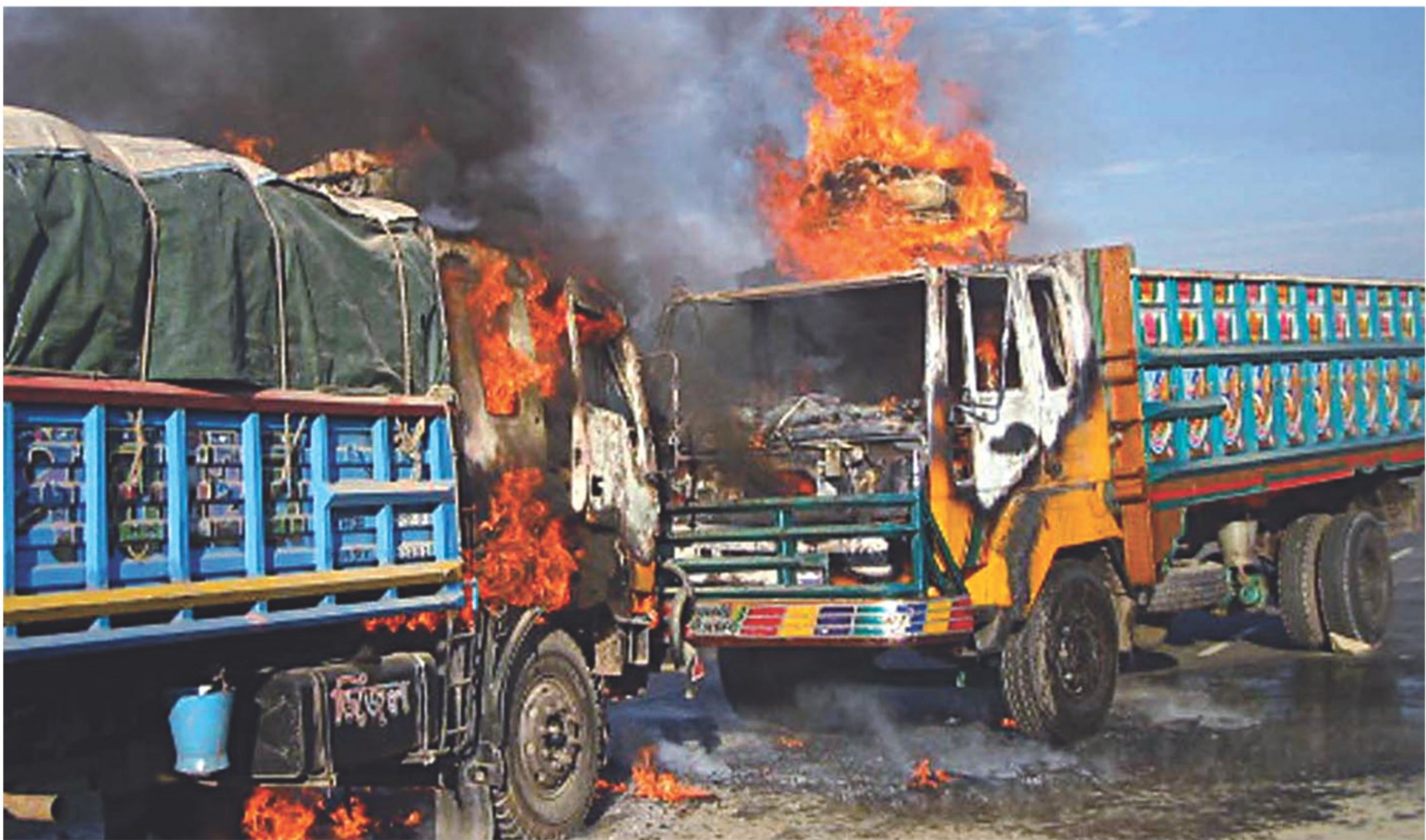
Trucks burn on the Dhaka-Chittagong highway yesterday following an arson attack by Jamaat-Shibir activists protesting the arrest of their Sitakunda unit Jamaat leader Aminul Islam.