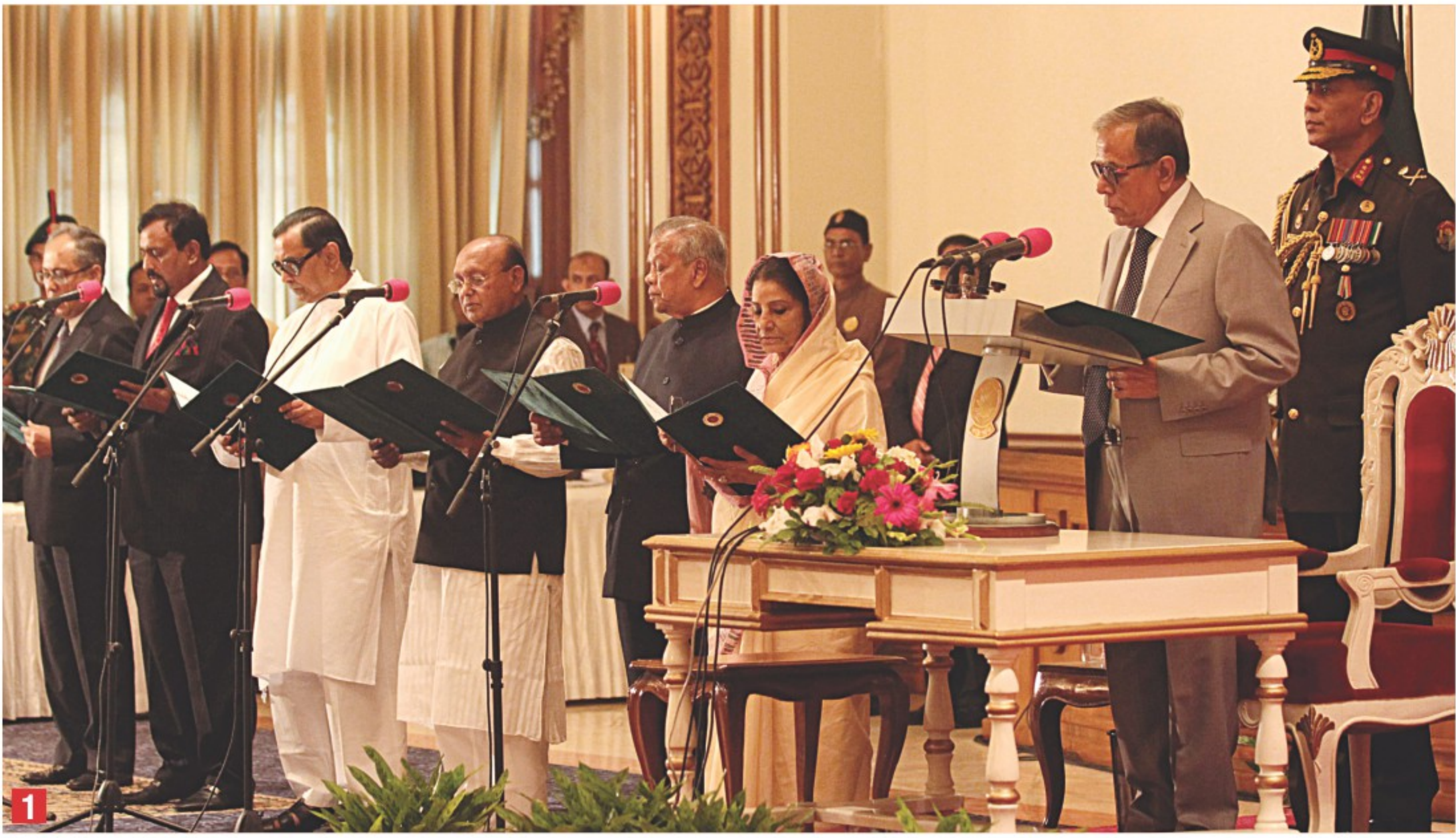
1) Six lawmakers of different political parties, except the main opposition BNP, being sworn in as ministers of an election-time government by President Abdul Hamid at Bangabhaban yesterday. 2) Prime Minister Sheikh Hasina looks on as the event progresses. 3) Two state ministers of the new cabinet take the oath. 4) Ministers and politicians, including Jatiya Party Chairman HM Ershad, prior to the ceremony.

The High Court yesterday started hearing three separate writ petitions filed challenging the legality of ministers and state ministers, who recently submitted their resignation letters, holding offices. The HC bench of Justice Mirza Hussain Haider and Justice Muhammad Khurshid Alam Sarkar fixed today for resuming the hearing. Supreme Court lawyers Tuhin Malik, Abdullah-Al Baki, and Eunus Ali Akond filed the petitions. They said in the petitions that the offices of the ministers are vacant as per article 58 (1) of the constitution, as they (ministers) handed over their resignation letters to the prime minister on November 10 for submitting those to the president.