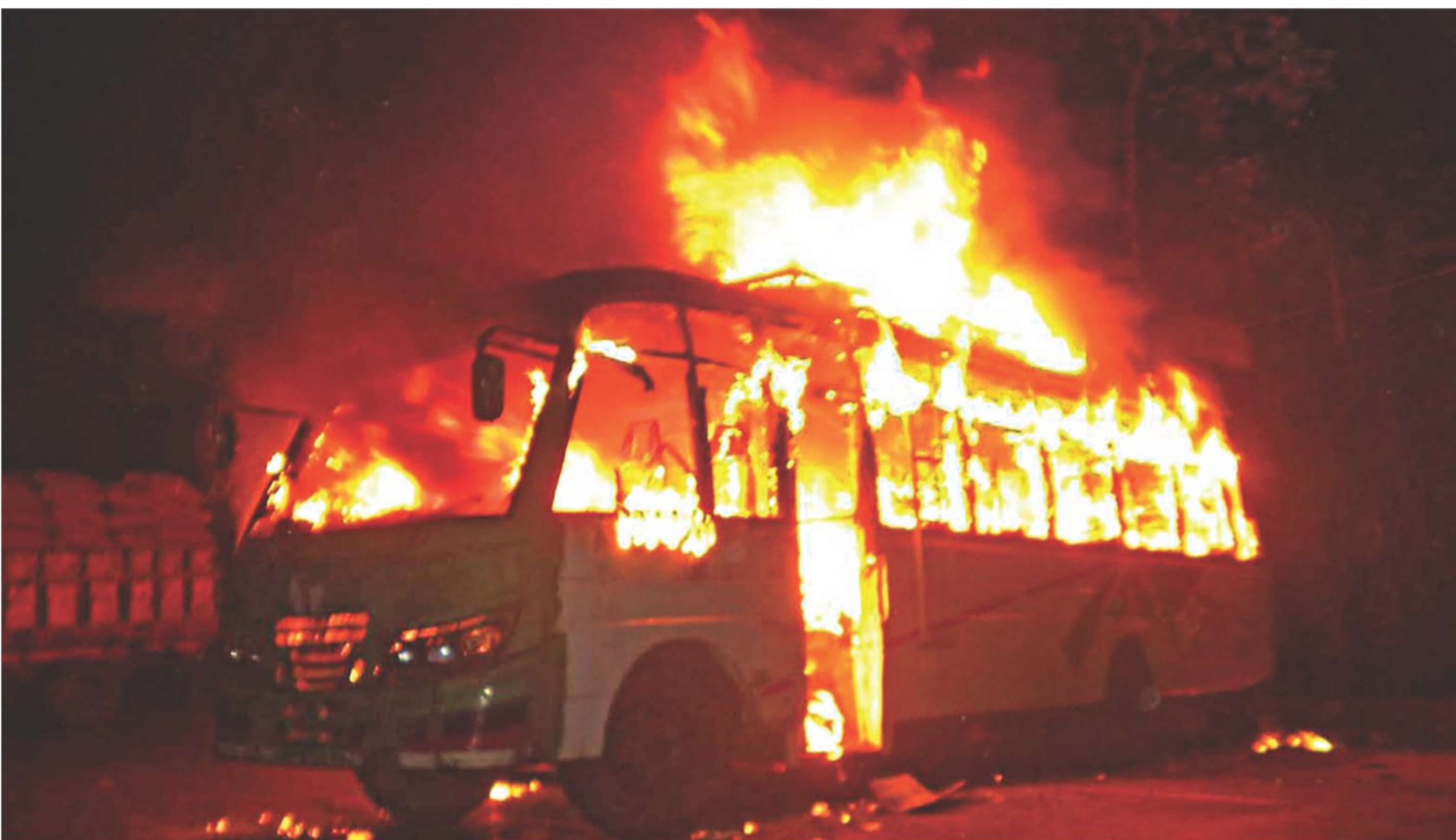
A bus goes up in flames in Sitakunda on the Dhaka-Chittagong highway after BNP-Jamaat activists set it alight during their clash with law enforcers yesterday evening.