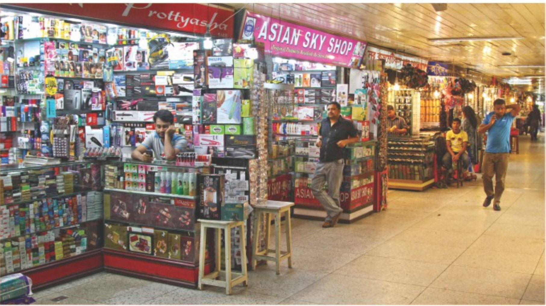
Fed up with hartals, small businesses open their shops at Eastern Plaza in Dhaka yesterday. Shop owners see a slump in their earnings amid poor customer turnout.