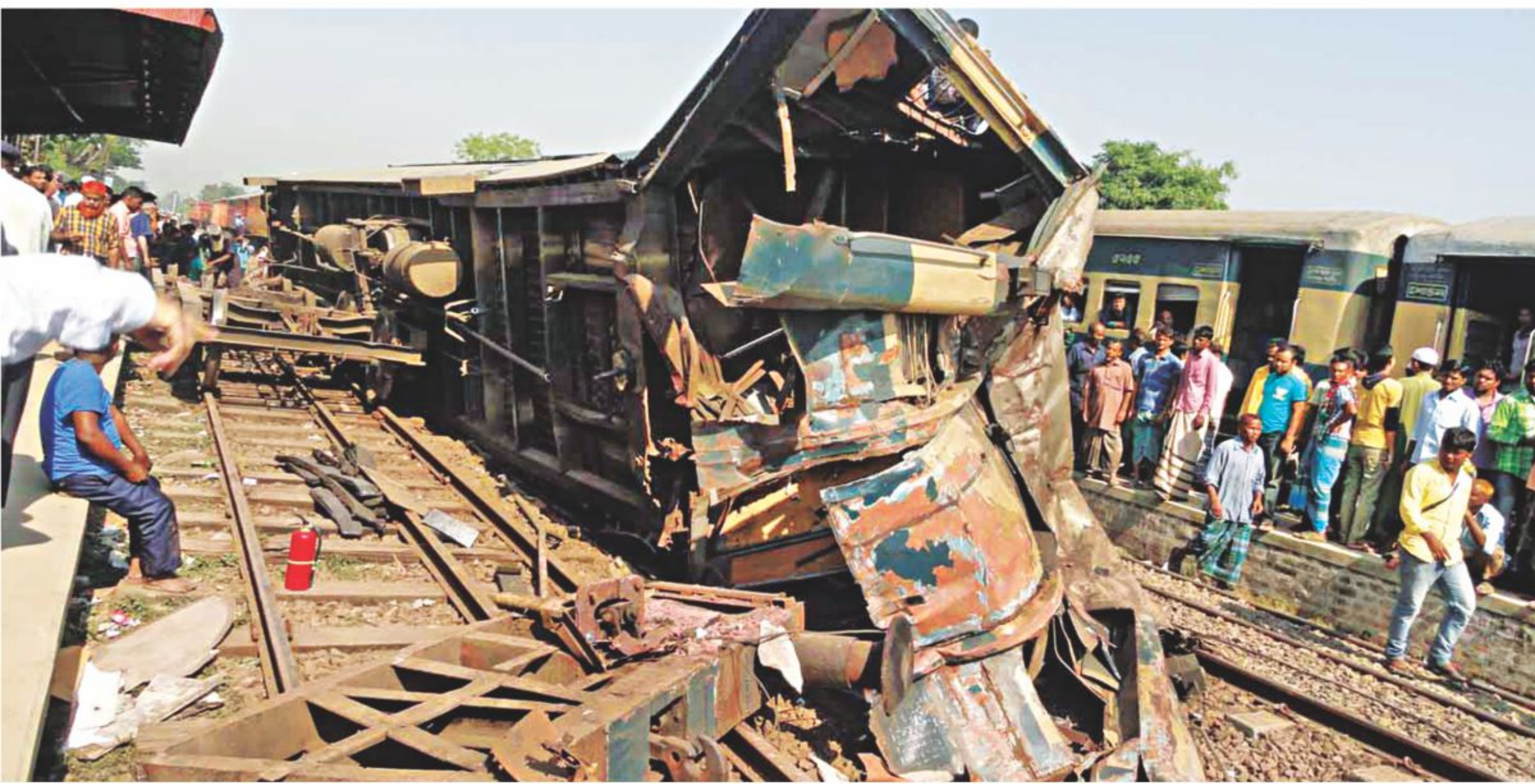
Wreckage of buggies caused by a head-on collision between two intercity trains in Phulbaria of Dinajpur yesterday. The accident injured at least 50 passengers.