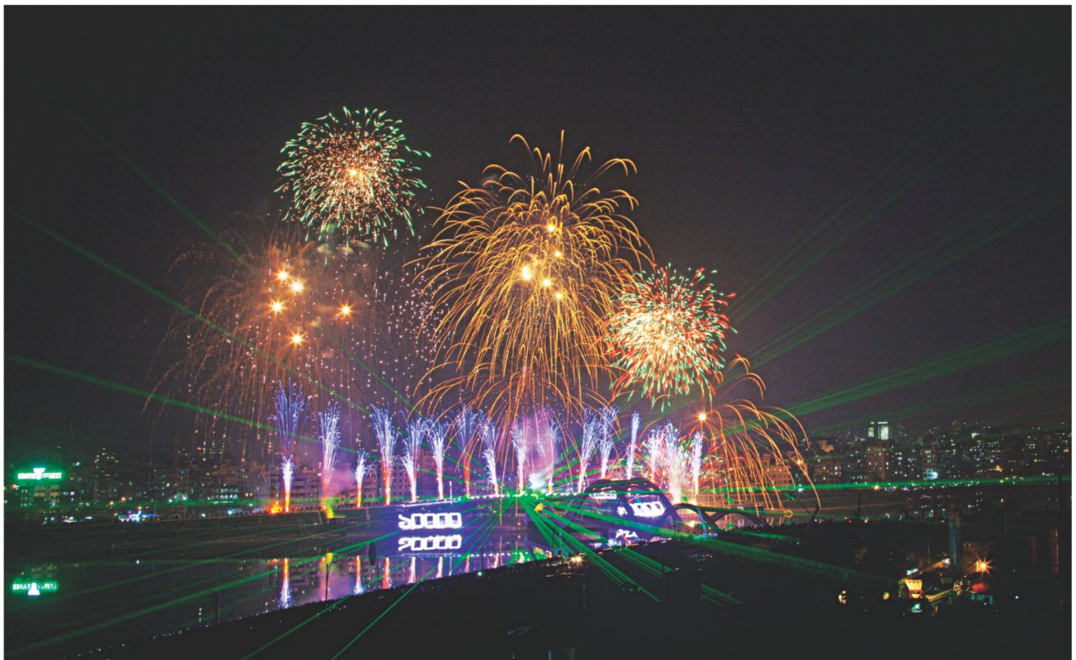
Fireworks and laser show at Hatirjheel project area in the capital yesterday on the occasion of celebrating the country's more than 10,000 MW of power generation capacity.