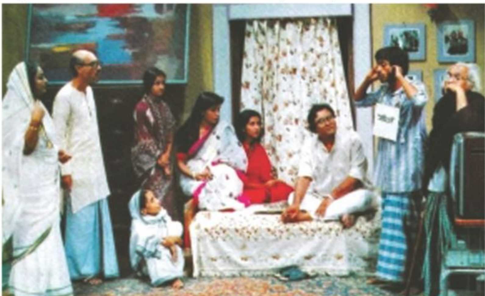
A scene from "Bohubrihi"; (top) Behind-the-scenes of "Kothao Keu Nei".