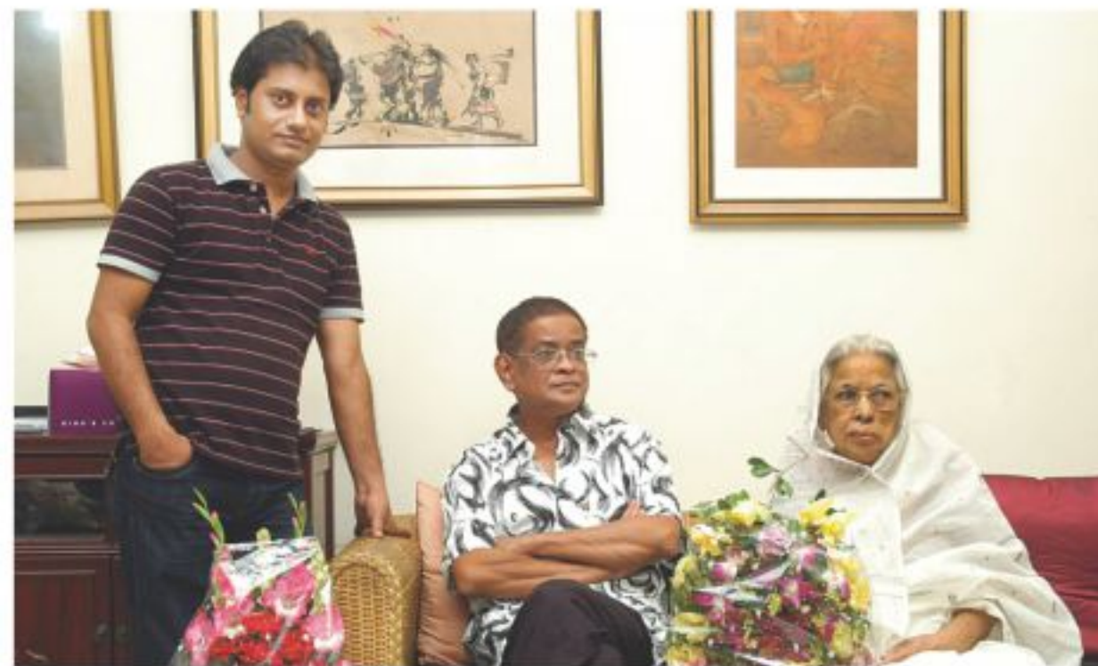
The writer (L), seen with Humayun Ahmed and his mother on his birthday.

Today is the birthday of Humayun Ahmed, a prominent figure in the world of Bengali literature. On the day, he was born in Kutubpur village of Netrakona district. As filmmaker and playwright, the versatile talent entertained millions of viewers of the small and silver screen. Early in his career, he served as professor at Dhaka University. After the Liberation War, Humayun wrote a novel titled "Nondito Noroke", beginning his journey as a litterateur. From then, on the author enjoyed unprecedented popularity in the country's writing arena for over three decades. At one stage, he quit his university job and stepped into the world of entertainment, and made several films such as "Aguner Parashmoni" and "Srabon Megher Din". In addition, he penned the script of many timeless TV plays. He created classics like "Eishob Dinratri", "Bohubrihi", "Ayomoy", "Kothao Keu Nei", "Nakkhatrer Rat", "Sabuj Chhata" and "Ochin Brikkho". Of them, Baker Bhai, the leading character of "Kothao Keu Nei" earned him huge popularity. This correspondent often visited the author at his residence Dokhin Hawa. In 2006, he along with other news-