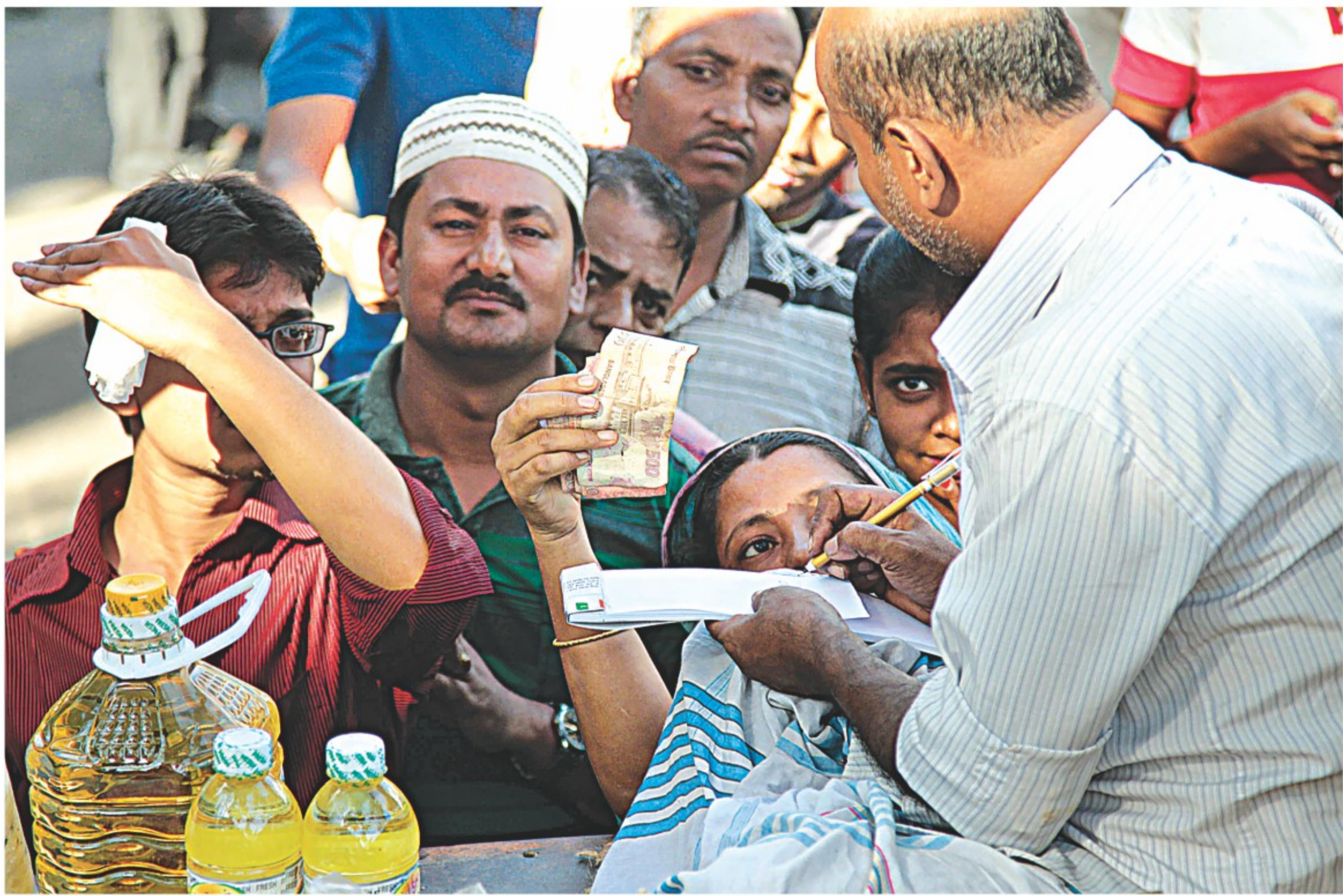
People in queue buy goods from a TCB fair price outlet in front of the Jatiya Press Club yesterday. A series of long hartals has left the capital short on essential supplies, shooting up prices in its kitchen markets.