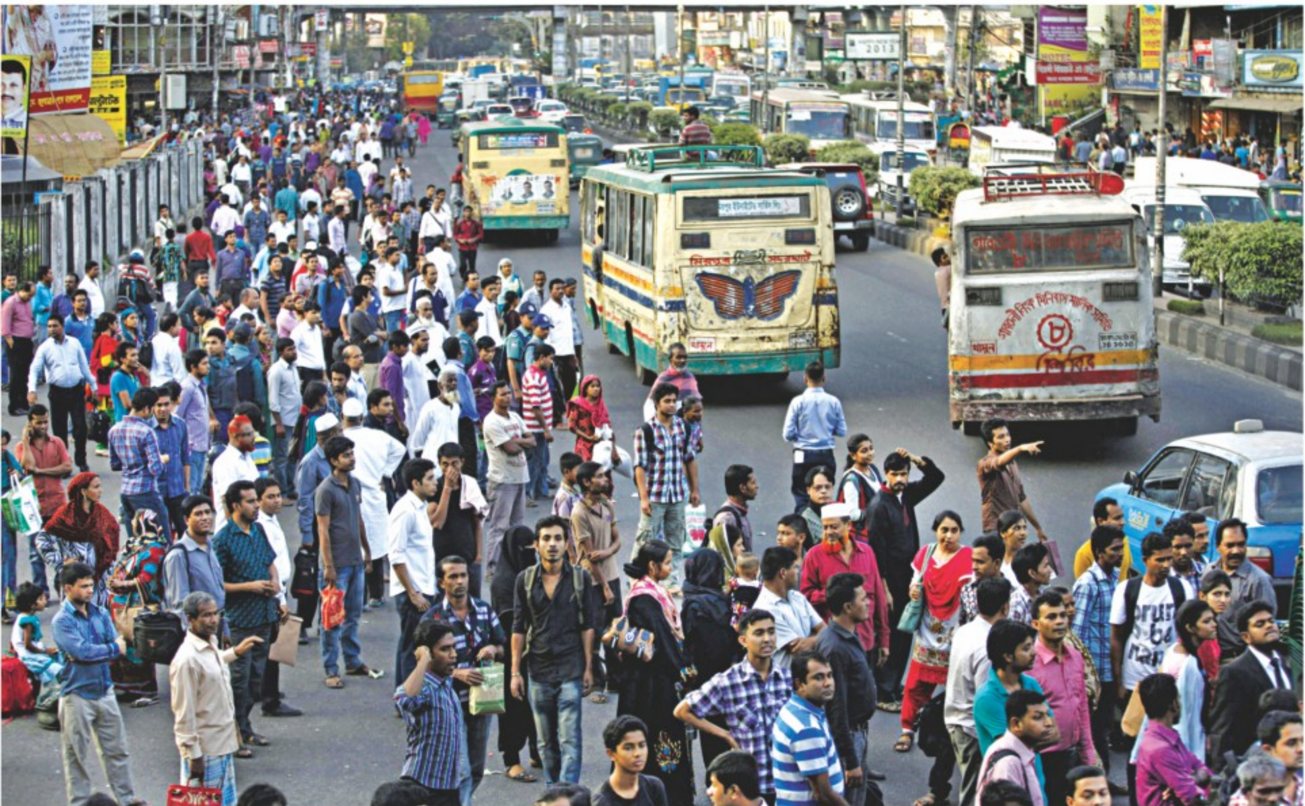
City dwellers wait at Farmgate for transport yesterday as many buses, taxis and auto rickshaws chose to stay off the streets fearing pre-hartal violence.