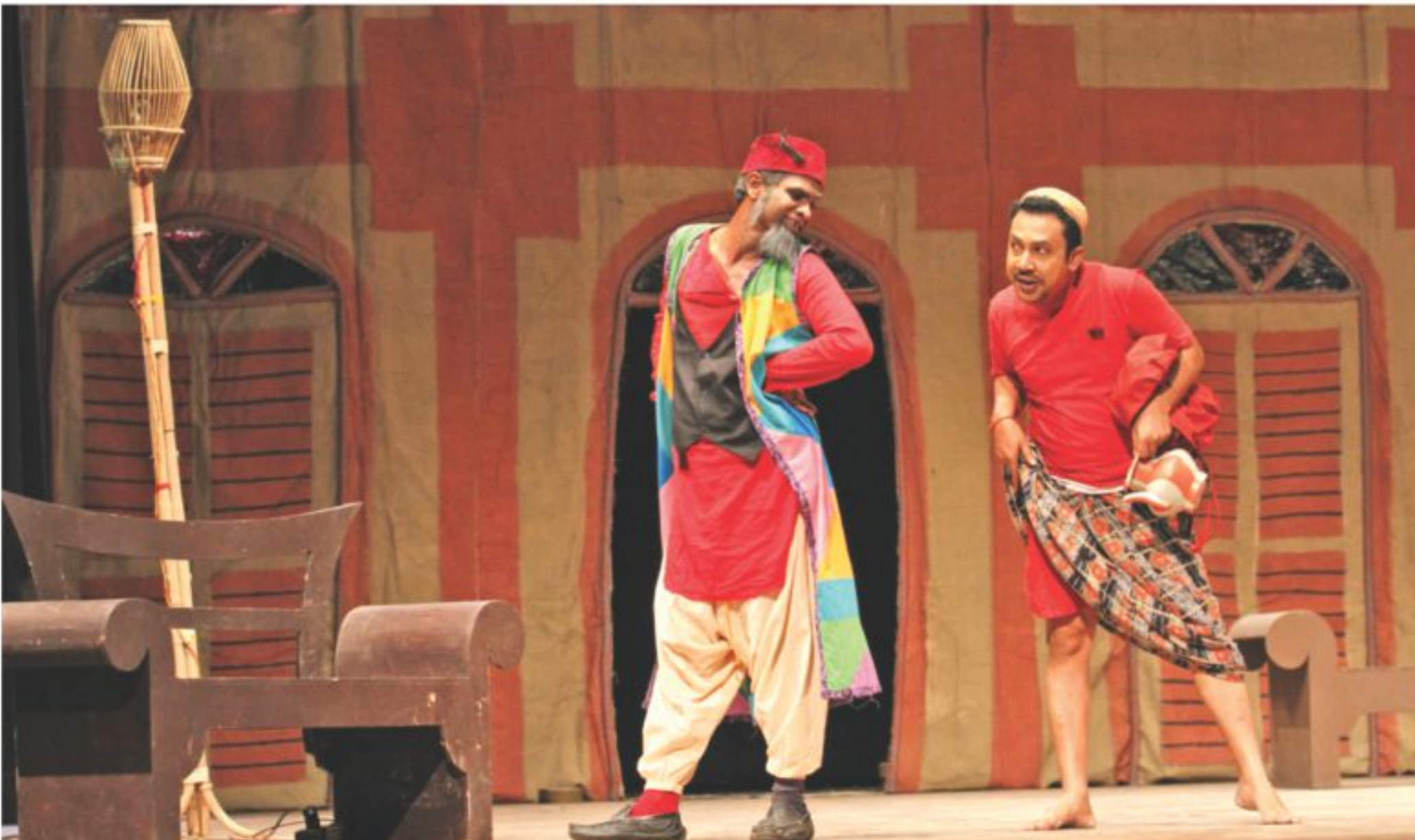
A scene from the play.