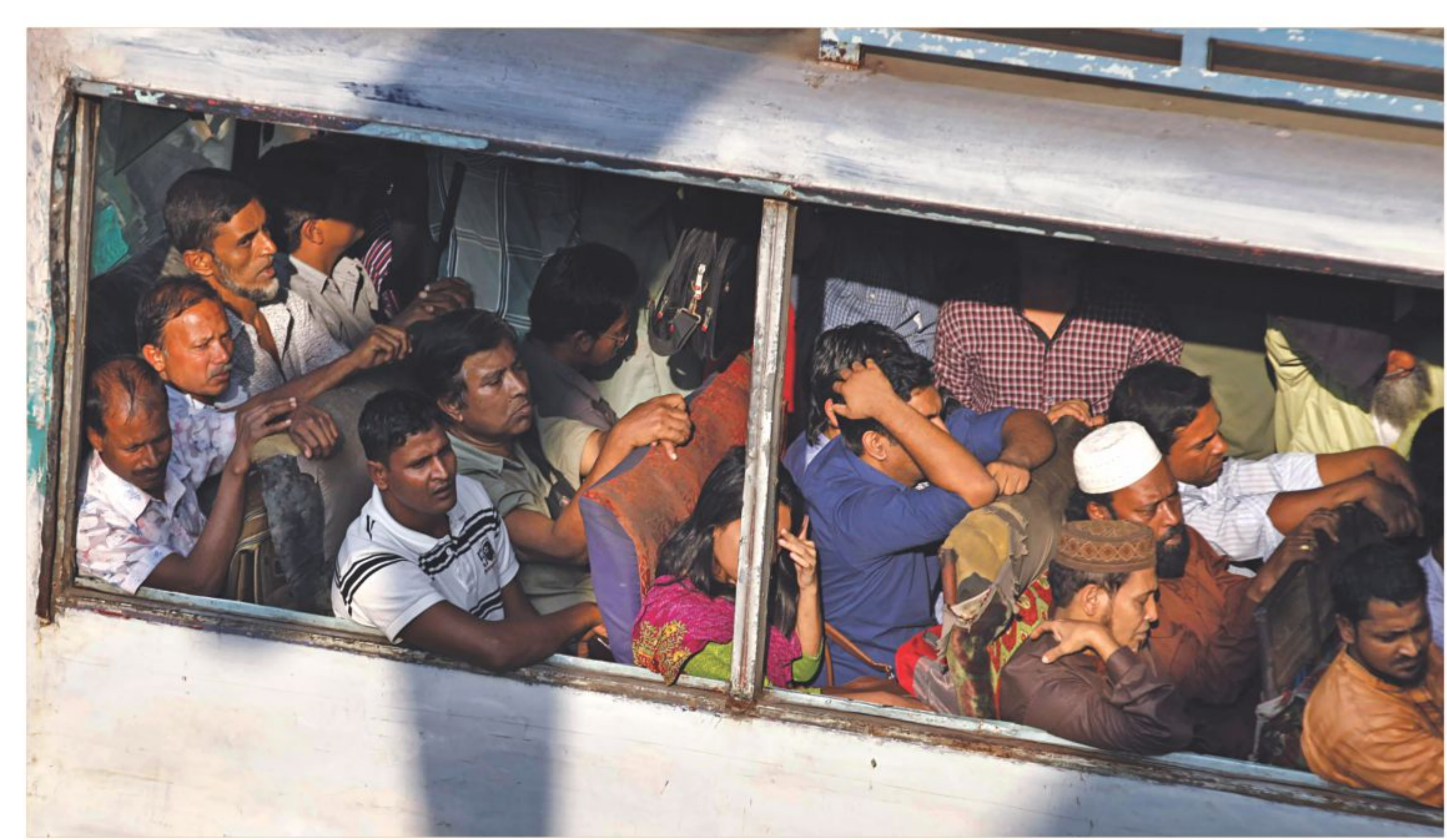
A bus devoid of windows plies in the capital's Bangla Motor area, raising questions on whether it does have a fitness certificate. But even if it did have the windows, it would run the risk of being vandalised in the recent hartal violence. Most buses in the capital have no fitness certificates and the violence is acting as a deterrent for the owners to get one.