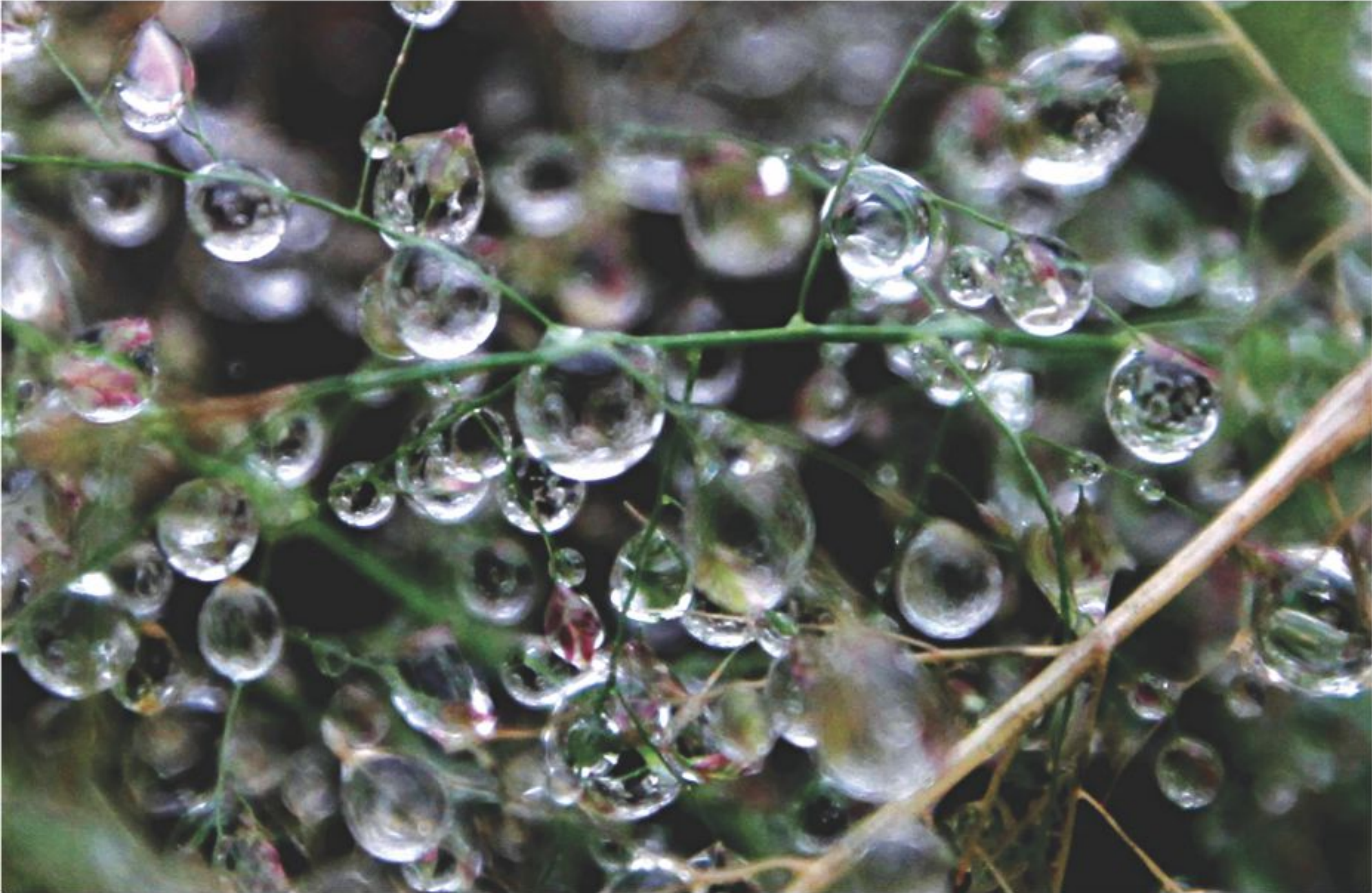
Dew drops on grass glitter like crystal. The dews in Hemanta, one of the six seasons in Bangladesh, herald the winter which is just weeks away. The photo was taken yesterday morning in the stadium area of Chittagong city.