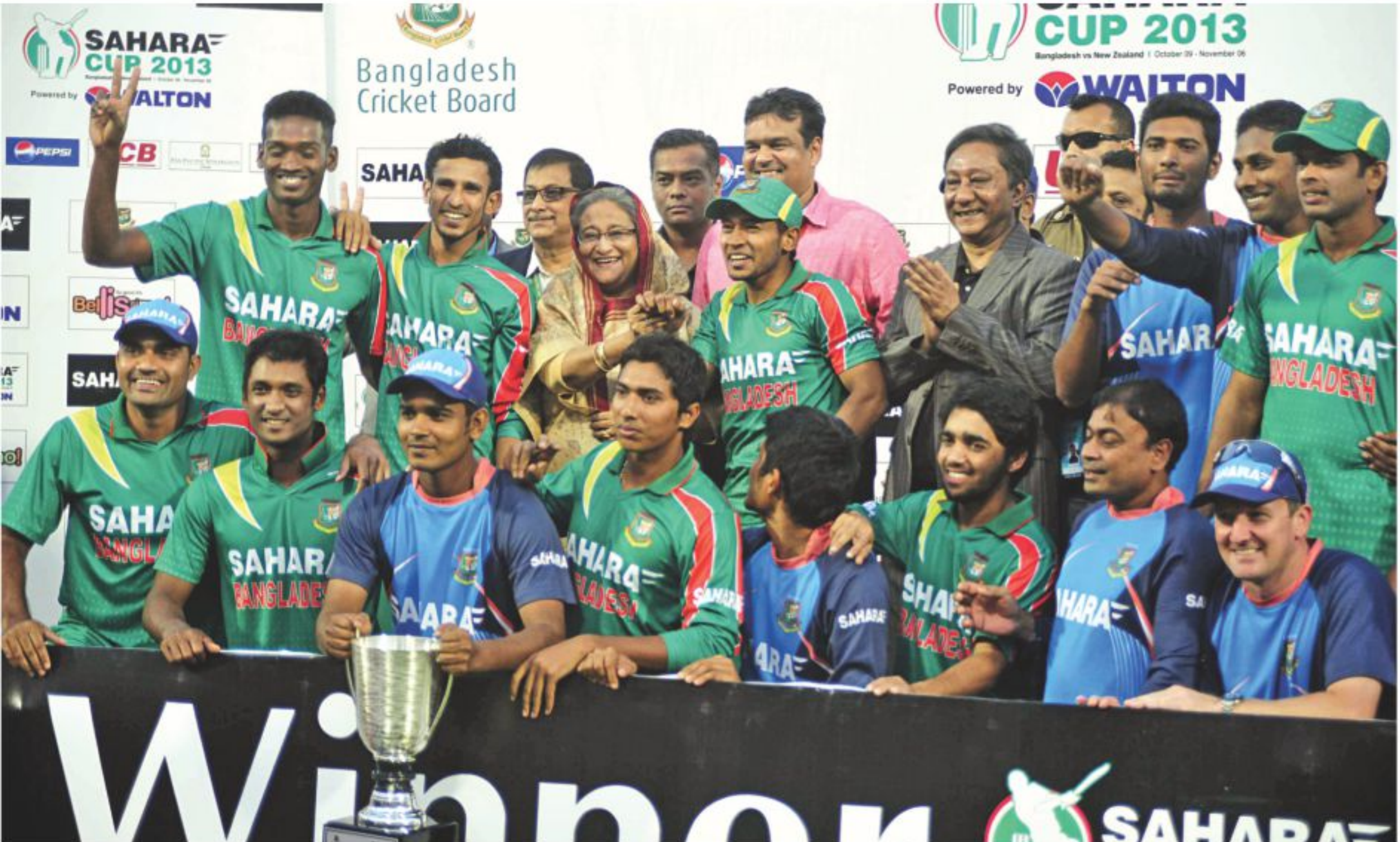
Prime Minister Sheikh Hasina is seen with the Bangladesh national cricket team members during the presentation ceremony of the Sahara Cup 2013 at the Sher-e-Bangla National Stadium in Mirpur yesterday.