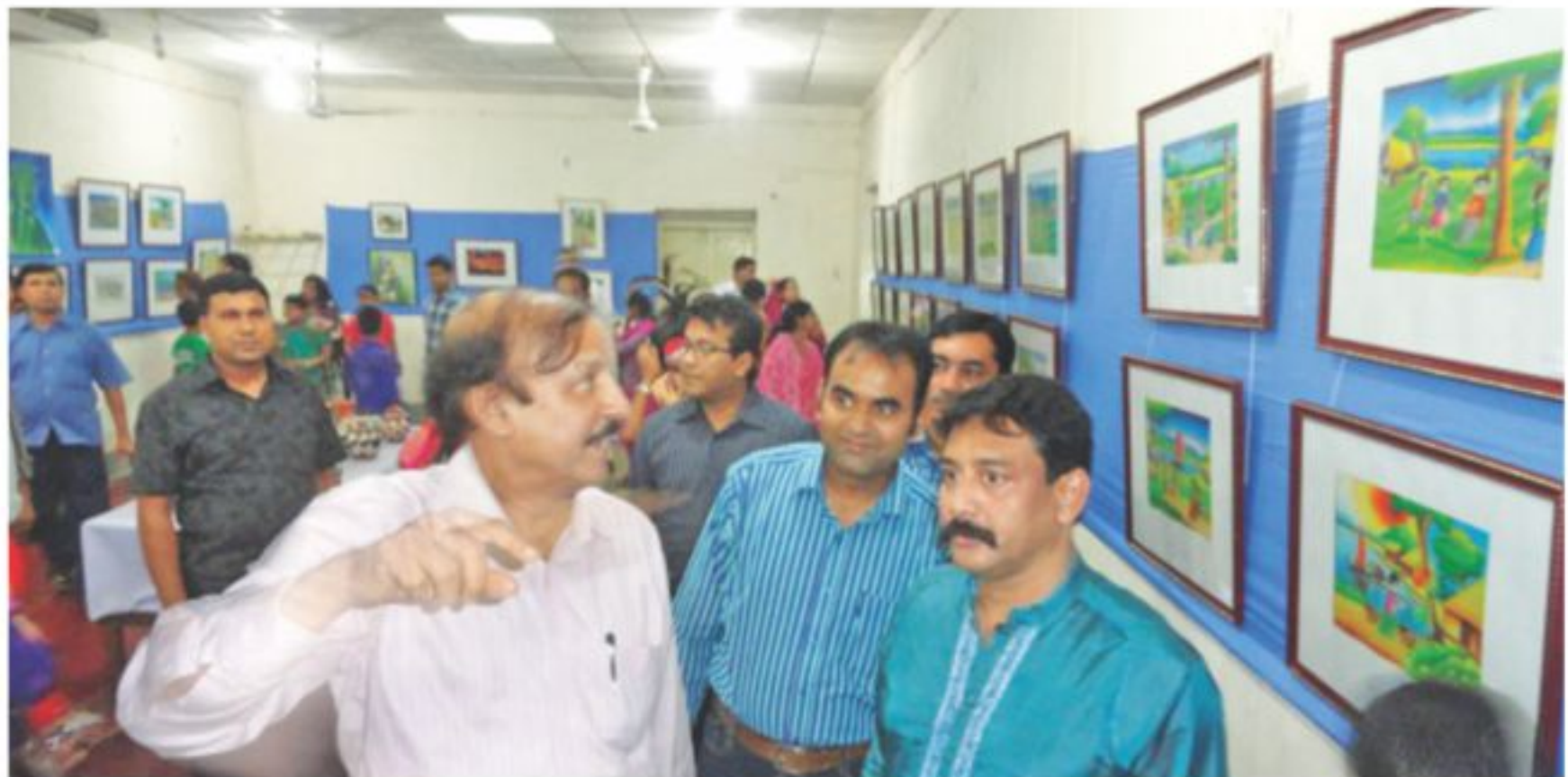
M Hamid visits the exhibition.

The artists used various mediums including oil and watercolour; pen and