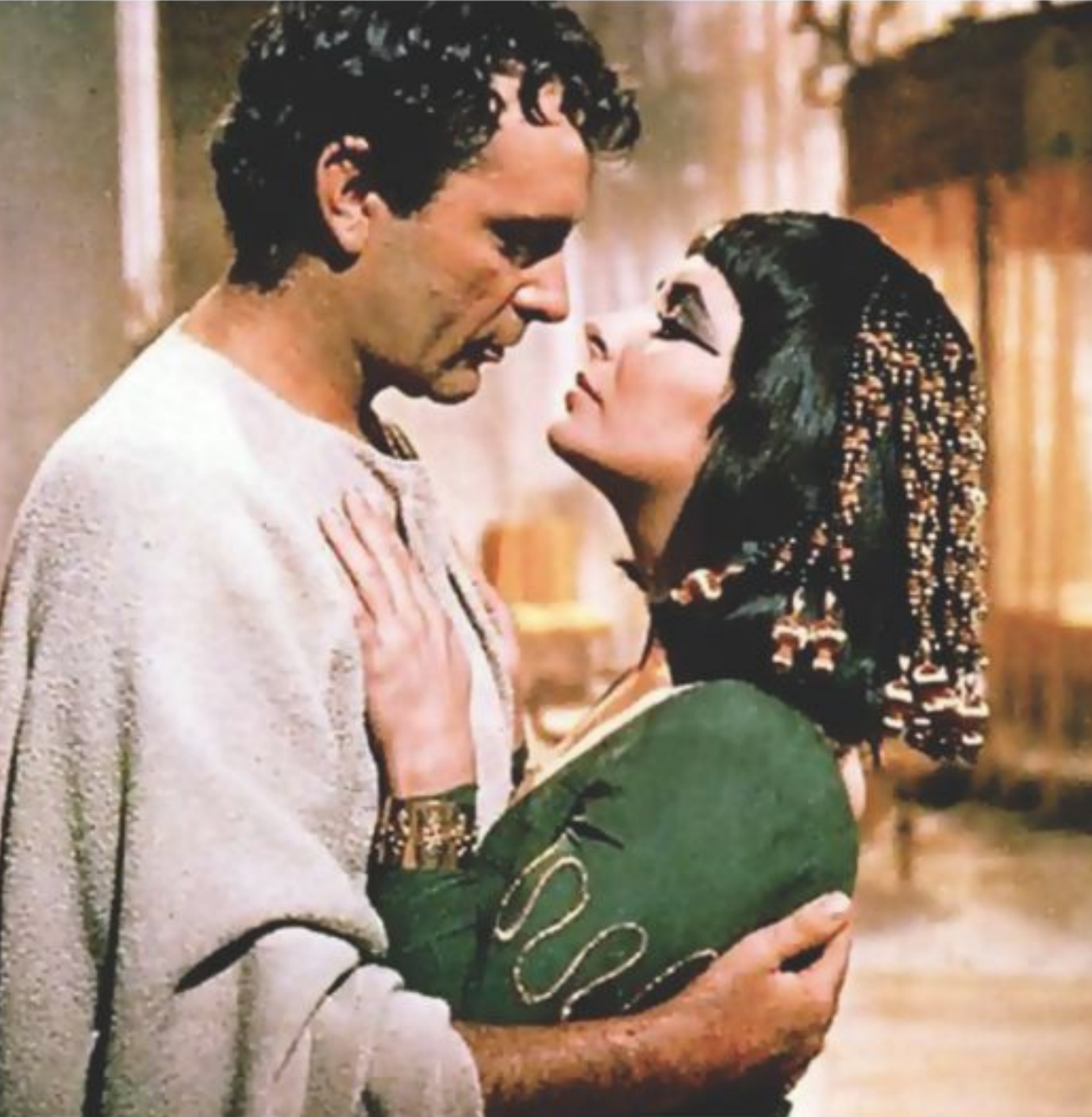
One of the most celebrated couples of global cinema, Burton and Taylor in "Cleopatra" (Left); 12-year old Elizabeth Taylor in "National Velvet".

From 1985, after her long-standing friend (sometimes also labeled lover) Rock Hudson succumbed to AIDS, she became a crusader for the AIDS-afflicted. She also co-founded the American Foundation for AIDS Research and the Elizabeth Taylor AIDS Foundation. She received numerous awards for her work with AIDS sufferers. Her acting abilities remained upfront and she received a Lifetime