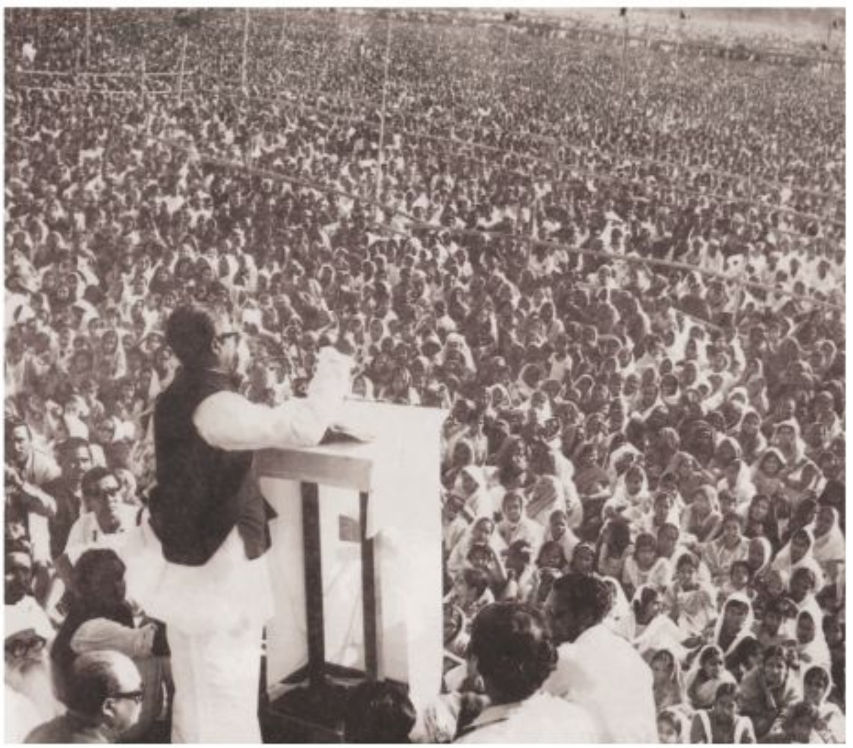
Bangabandhu's historic March 7 address is documented in "1971".