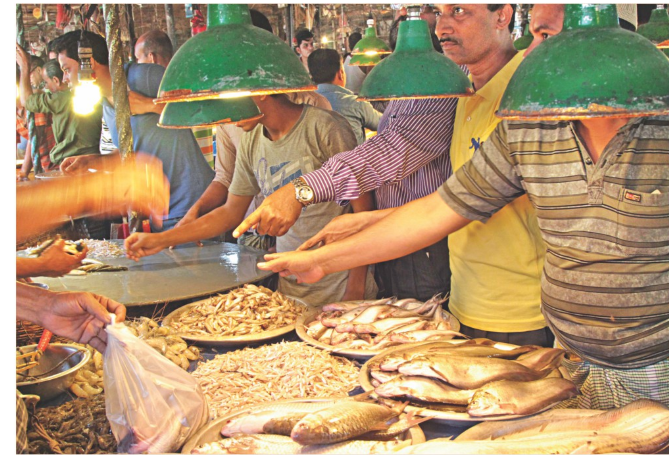
People crowd and haggle over fish prices in the capital's Malibagh Bazar yesterday. A buying frenzy has been sparked against the backdrop of another 60-hour hartal declared by the BNP-led 18-party alliance from tomorrow.

Justice Debesh Bhattacharya and Former MP Chitra Bhattacharya Foundation will hold religious and social events in Ellenga, Tangail today marking the 99th birth anniversary of eminent SEE PAGE 4 COL 4