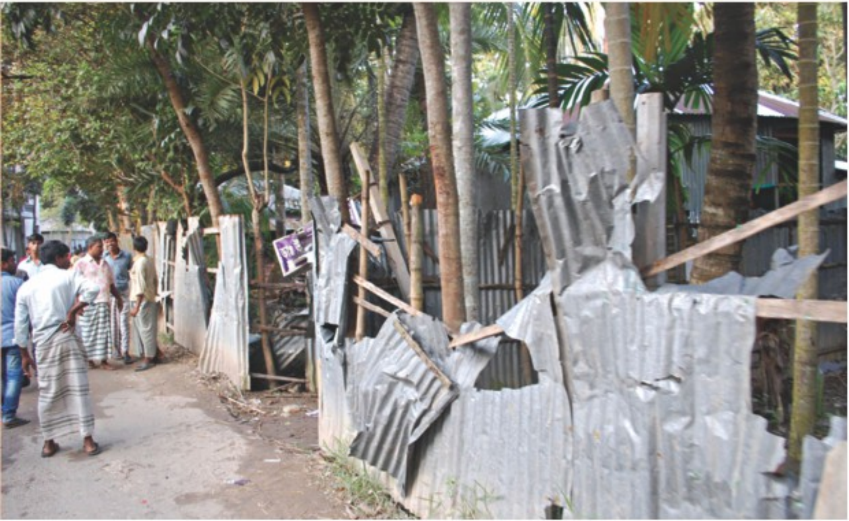
A mob, frenzied by apparently a baseless claim that a Hindu boy disrespected Prophet Muhammad (PBUH), tore apart the corrugated iron sheet walls of a Hindu house, left, at Bonogram in Santhia of Pabna yesterday. They also vandalised the idol in a temple and gathered at the bazaar where law enforcer tried to control the mob.