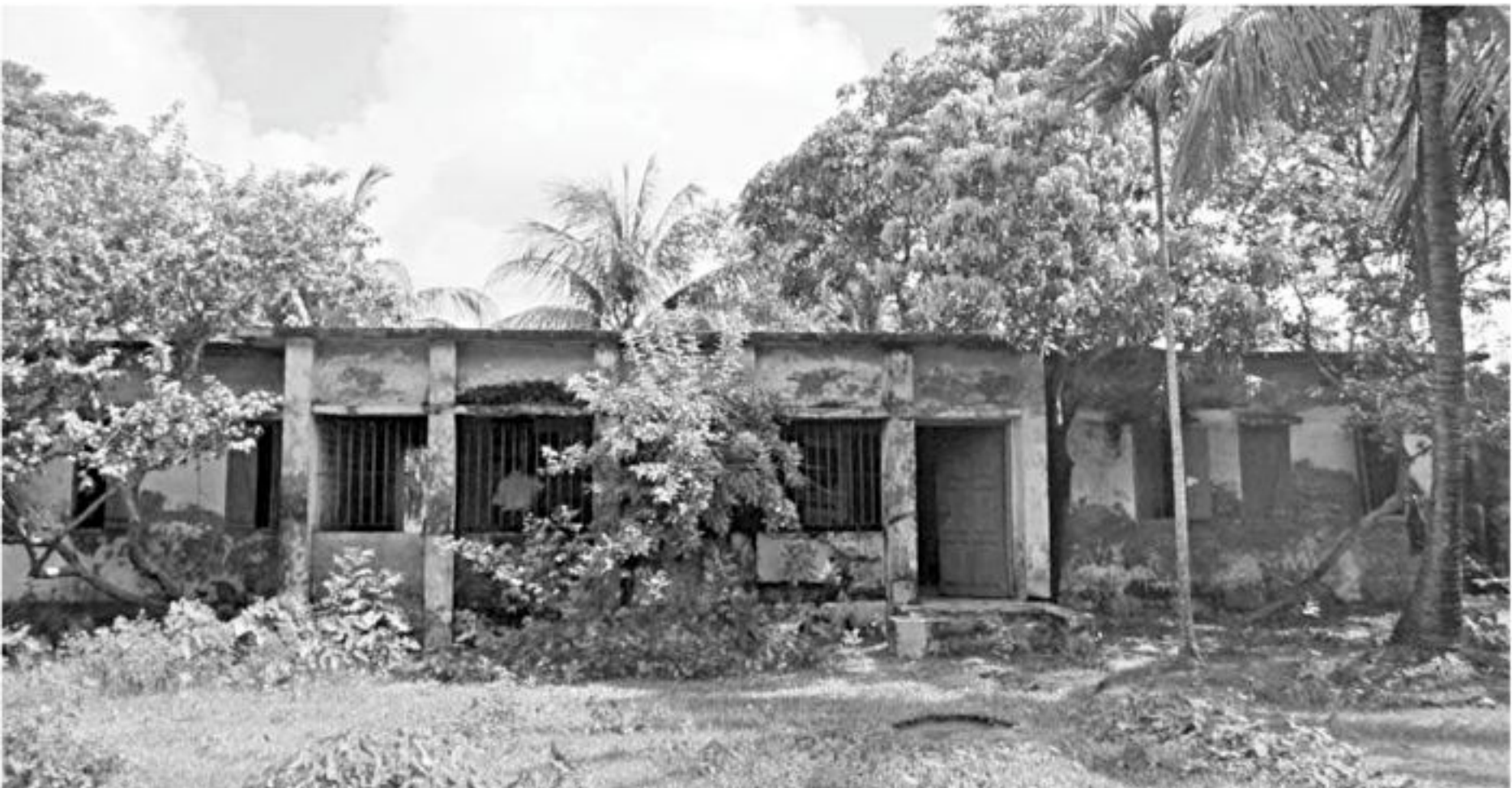
Dhulasar union family welfare centre in Kalapara upazila under Patuakhali district has remained abandoned for two years, thanks to the negligence of the authorities concerned.