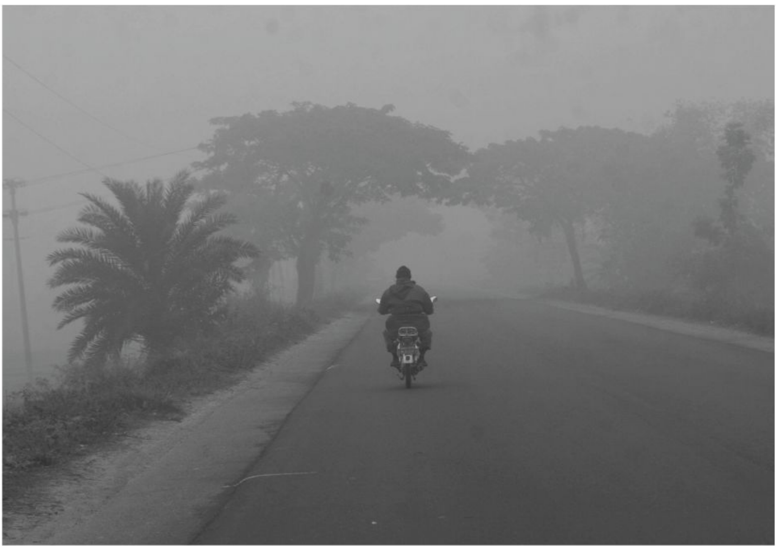
Dense fog appears in late autumn, as if heralding the advent of winter. The photo was taken from Dhaka-Tangail highway at Shibpur in Tangail sadar upazila on Wednesday morning.