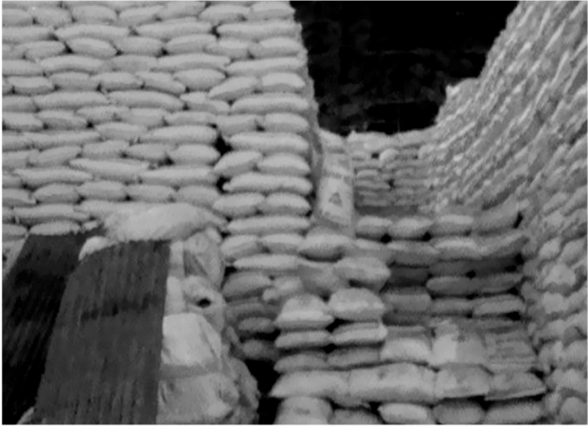
A warehouse of Panchagarh Sugar Mills is packed with around 6,200 tonnes of sugar produced in the last two seasons. The item has remained unsold as its mill rate is higher than the retail market price.

Consequently, fund crisis gripped the two mills and over a hundred officials and employees who went into retirement in last two years are yet to get their retirement allowance.