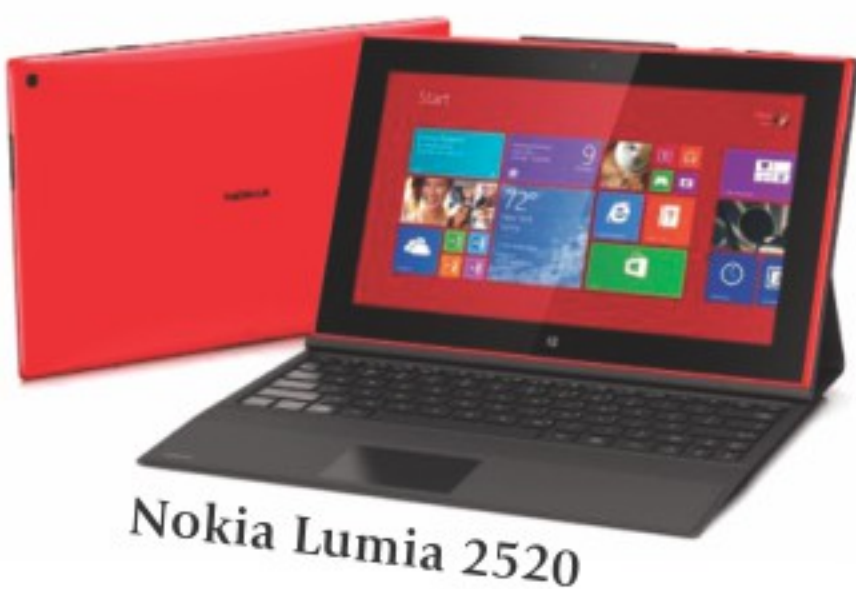
Nokia Lumia 2520

The event in Abu Dhabi starts with the release of the Lumia 1320: a mid-range phablet with a 720p 6 inch IPS screen protected by Gorilla Glass 3. Running the show is Windows Phone 8 - GDR3 update in tow - coupled with a dual-core 1.7 GHz Snapdragon 400 chipset. The star of the show was though the Lumia 1520, another 6 inch phablet with a 1080p IPS screen and a quad-core Snapdragon 800 processor running at 2.2 GHz. A key feature of this device is the 20 MP PureView cameras. We know that these will be the last products with the Nokia branding on the phones and tablets before Microsoft takes over but that did not stop