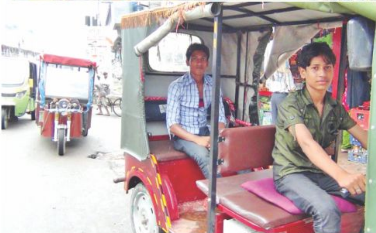
Battery-run three wheelers, locally called easy bikes, are now the main cause of frequent jam and accidents in three upazilla of the district. Inset, Teenage easy bike drivers ply the road without possessing valid drivers licenses.

chooses to turn a blind eye, reported a concerned civilian.