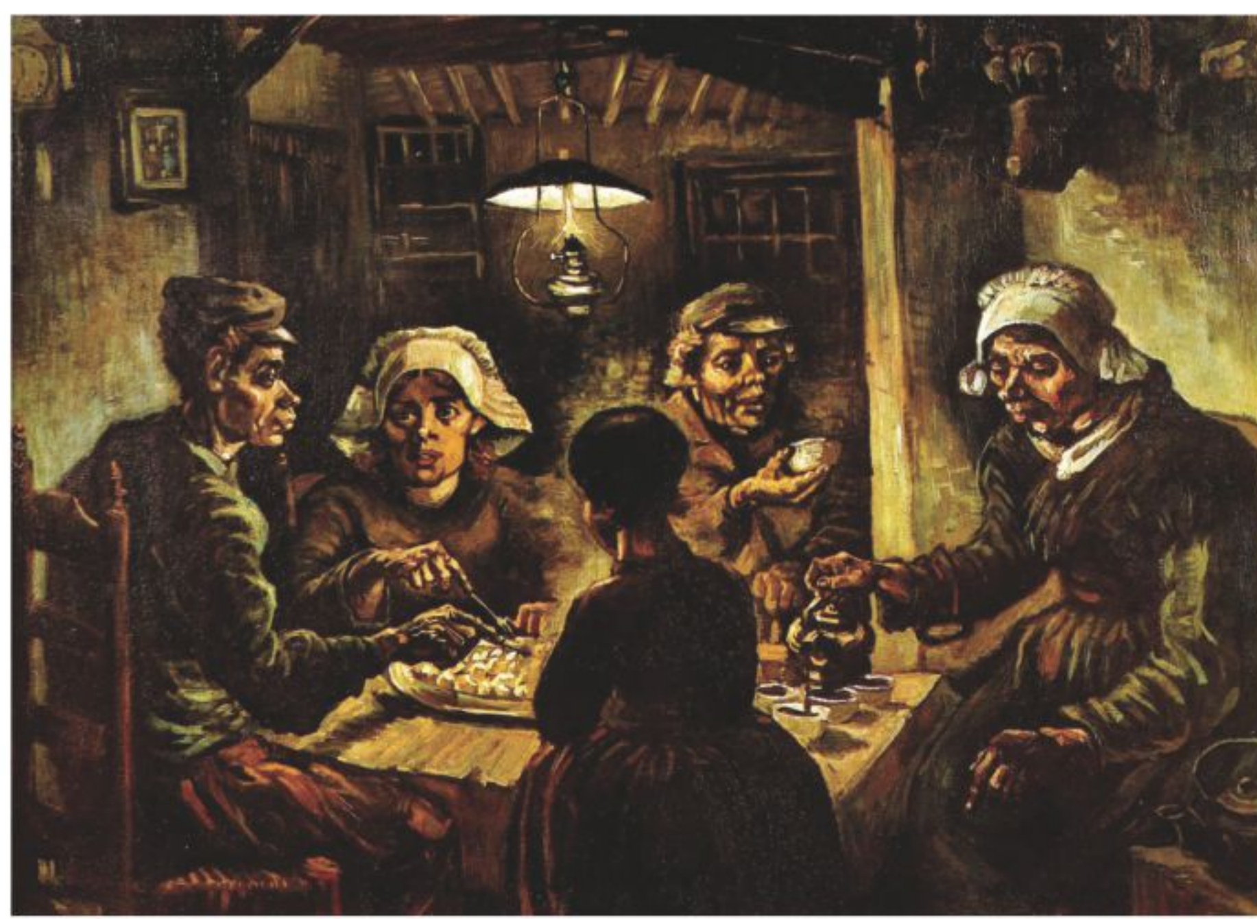
The Potato Eaters