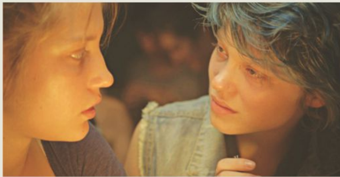
Risqué films that won big prizes: Scenes from "Brokeback Mountain" (top) and "La vie D'Adèle".