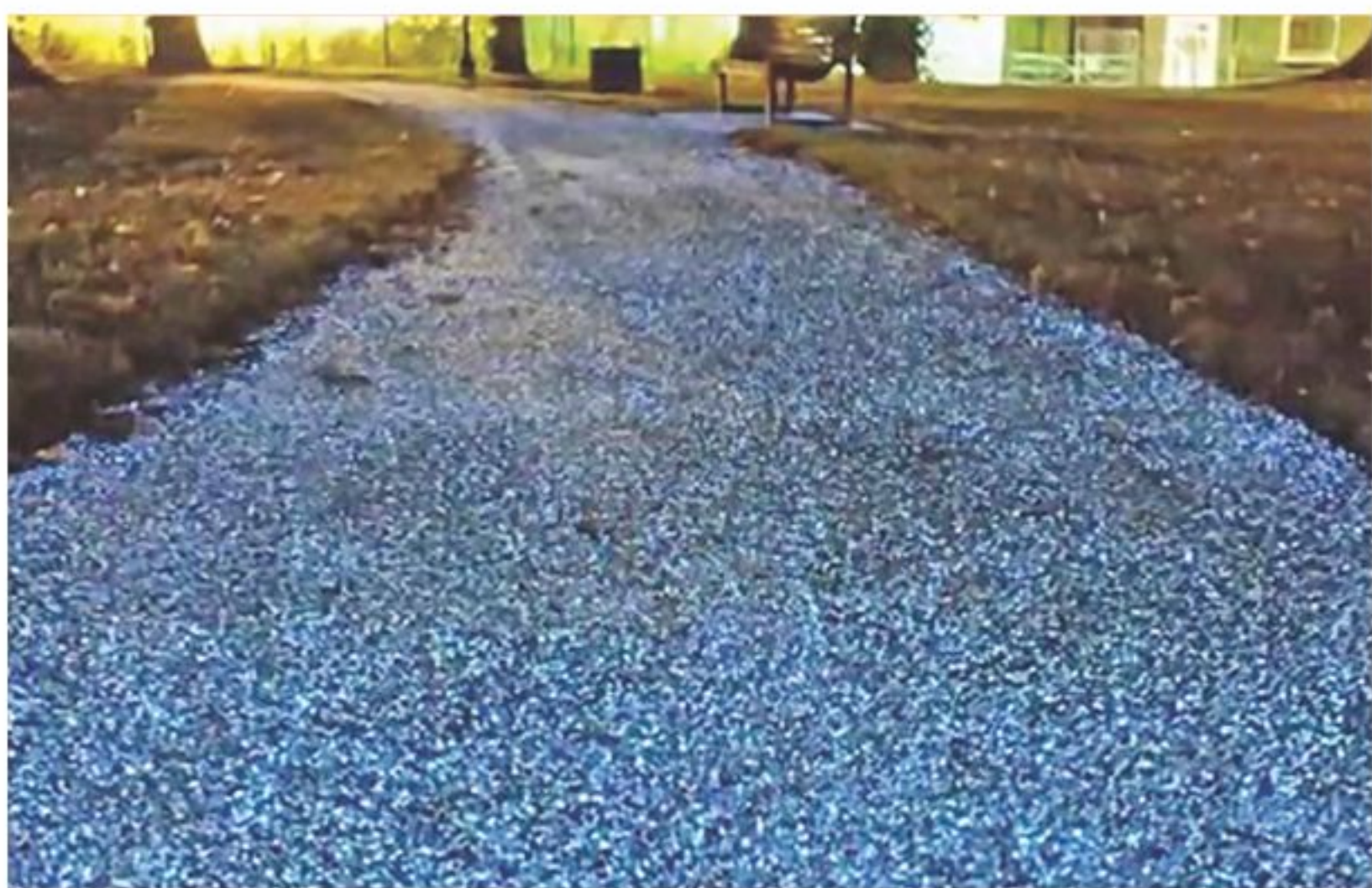
The glow-in-the-dark footpath.