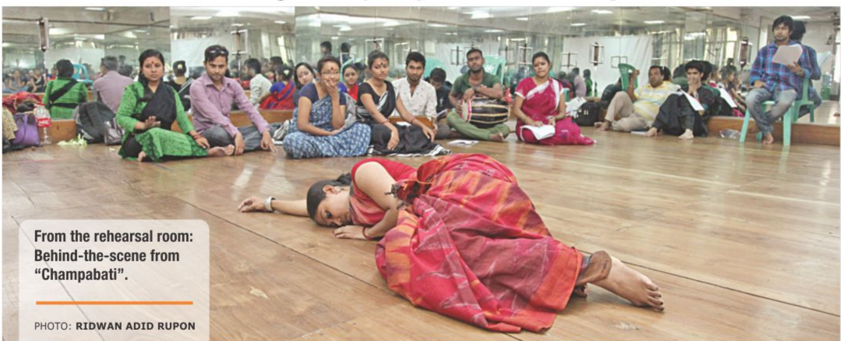
From the rehearsal room: Behind-the-scene from "Champabati".