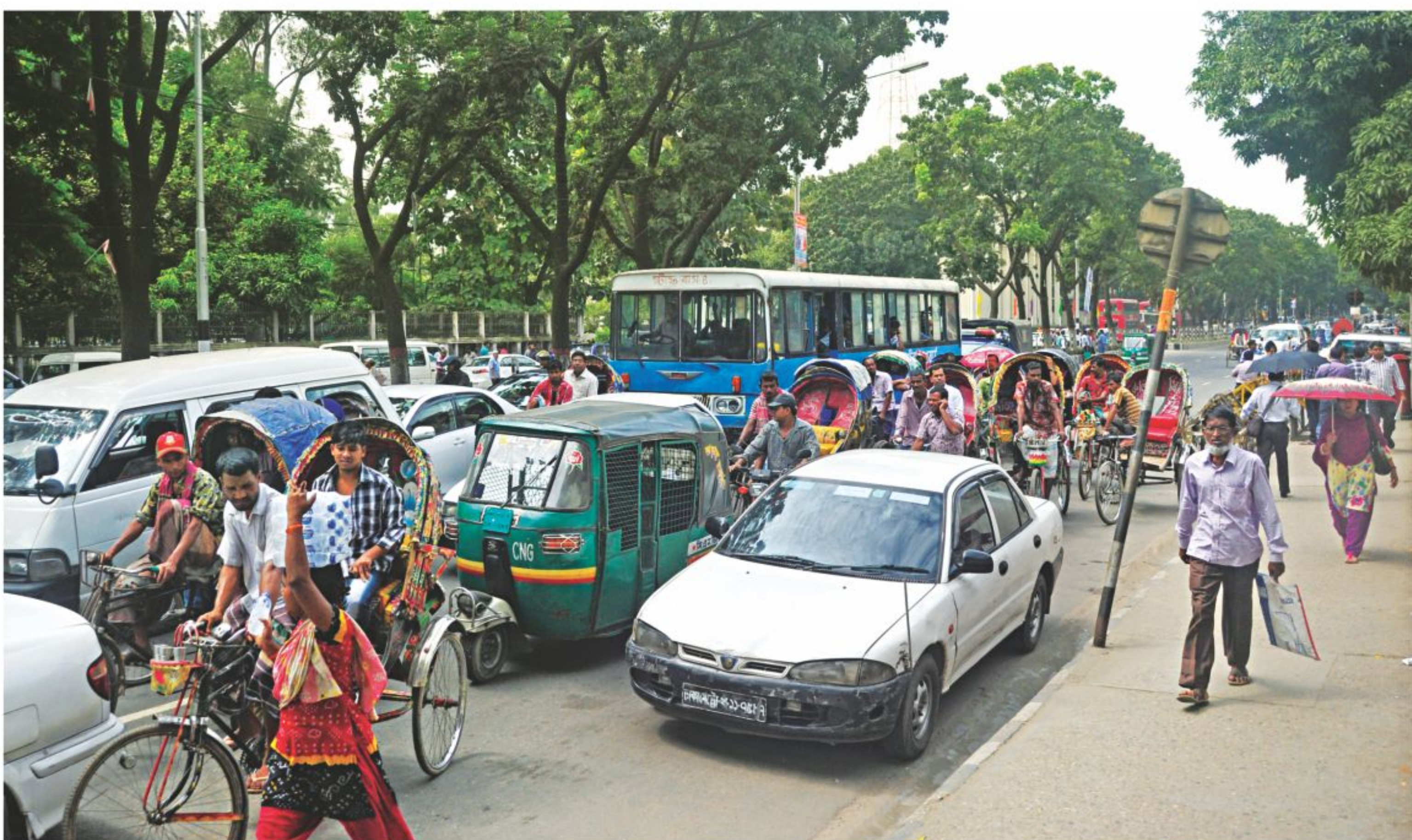
Rickshaws plying on Abdul Gani Road near the Bangladesh Secretariat in the capital on Tuesday in violation of traffic rules. The road is off limits to rickshaws.

Rickshaws are plying the city streets that are off-limits to non-motorised vehicles by bribing law enforcers. This increases accident risk and worsens the severe traffic congestion in the capital. Rickshaws are seen plying the "VIP roads", even in front of the Prime Minister's Office. Passengers on those rickshaws seem to be ignoring the risk of getting rear ended. Mirpur Road, Panthapath, Manik Mian Avenue, Phoenix Road, Ittefaq intersection to Bangabhaban, Hatirjheel, Gulshan Link Road and on occasion even Kazi Nazrul Islam Avenue tell the same story. "Traffic police receive Tk 80 a day from each rickshaw for letting the three-wheelers use the streets between Farmgate and Asad Gate intersection," a rickshaw puller told The Daily Star recently. This trend of allowing rickshaws to ply specific streets had begun just before Eid-ul-Fitr, in August, when traffic police, in exchange for petty bribes, relaxed the rules and allowed rickshaws and now-often-seen battery-run rickshaws to ply streets close to shopping malls. The illegal battery-run rickshaws have now become a SEE PAGE 11 COL 6