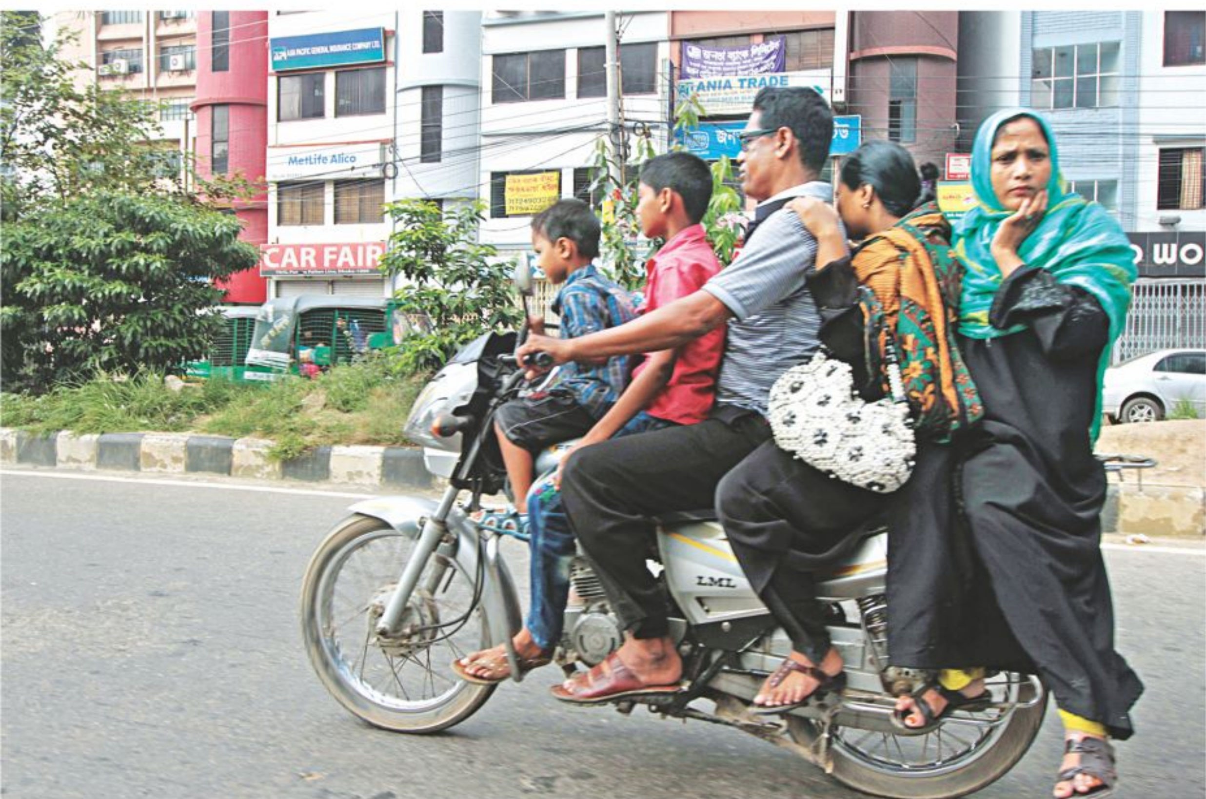
Five people, apparently of a family, ride a motorbike with none of them wearing any safety gear. The photo was taken near Nayapaltan in the capital yesterday.