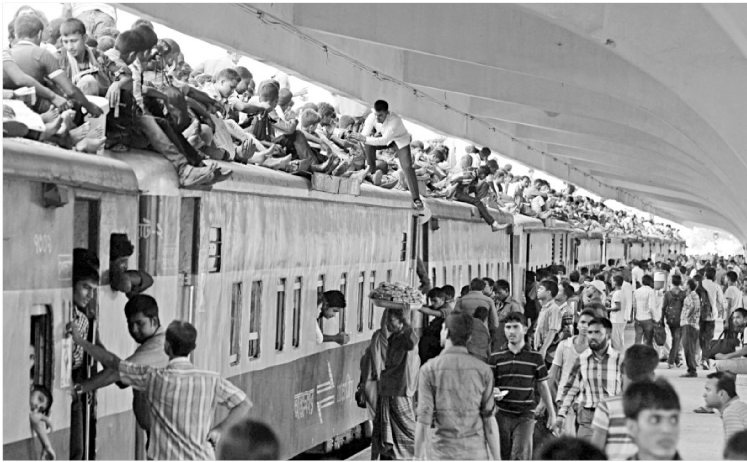
Many homebound people sitting on the train's roof could not get a seat inside the train despite purchasing tickets while others did not bother to get one. The photo was taken from Kamalapur Railway Station in the capital yesterday.

In addition, congregations will be held at Gulshan Central Mosque and Eidgah Maidan, SOS Shishu Polly Jame Mashjid at Shyamoli, Sabujbagh Jame Mosque, East End Club Maidan at Gendaria and at Sir Salimullah Muslim Orphanage field at Azimpur.