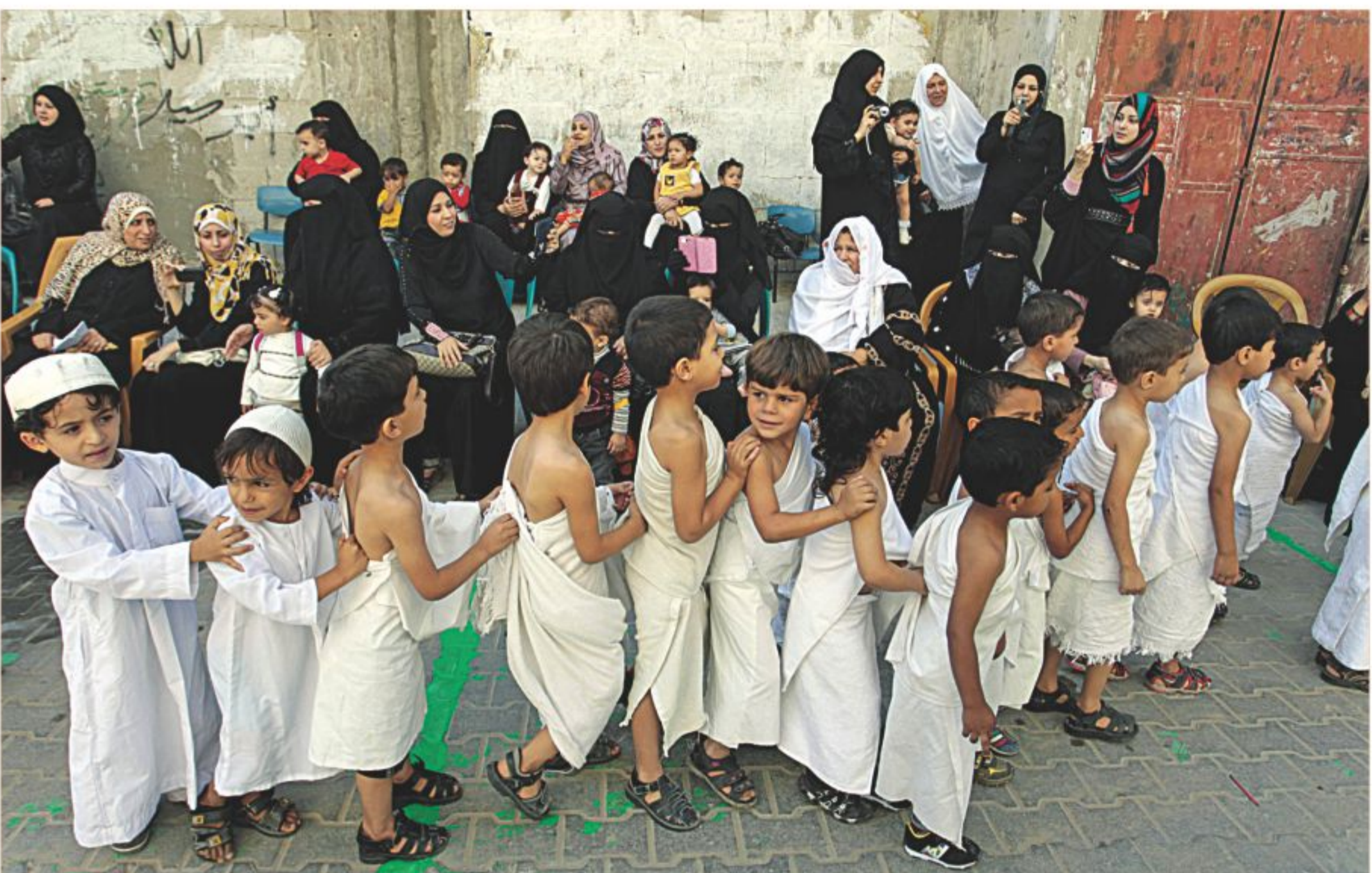
Palestinian children, boys dressed in Ihram, special outfits worn during the Hajj pilgrimage, stand in line in the yard of their school as they learn how to perform the rituals carried out during the annual Hajj pilgrimage in southern Gaza Strip, yesterday. Saudi Arabia's interior minister yesterday warned Muslim pilgrims against exploiting next week's annual hajj for political purposes.

Syria has won rare international praise for its cooperation with the chemical disarmament mission, deployed in Damascus since October 1.