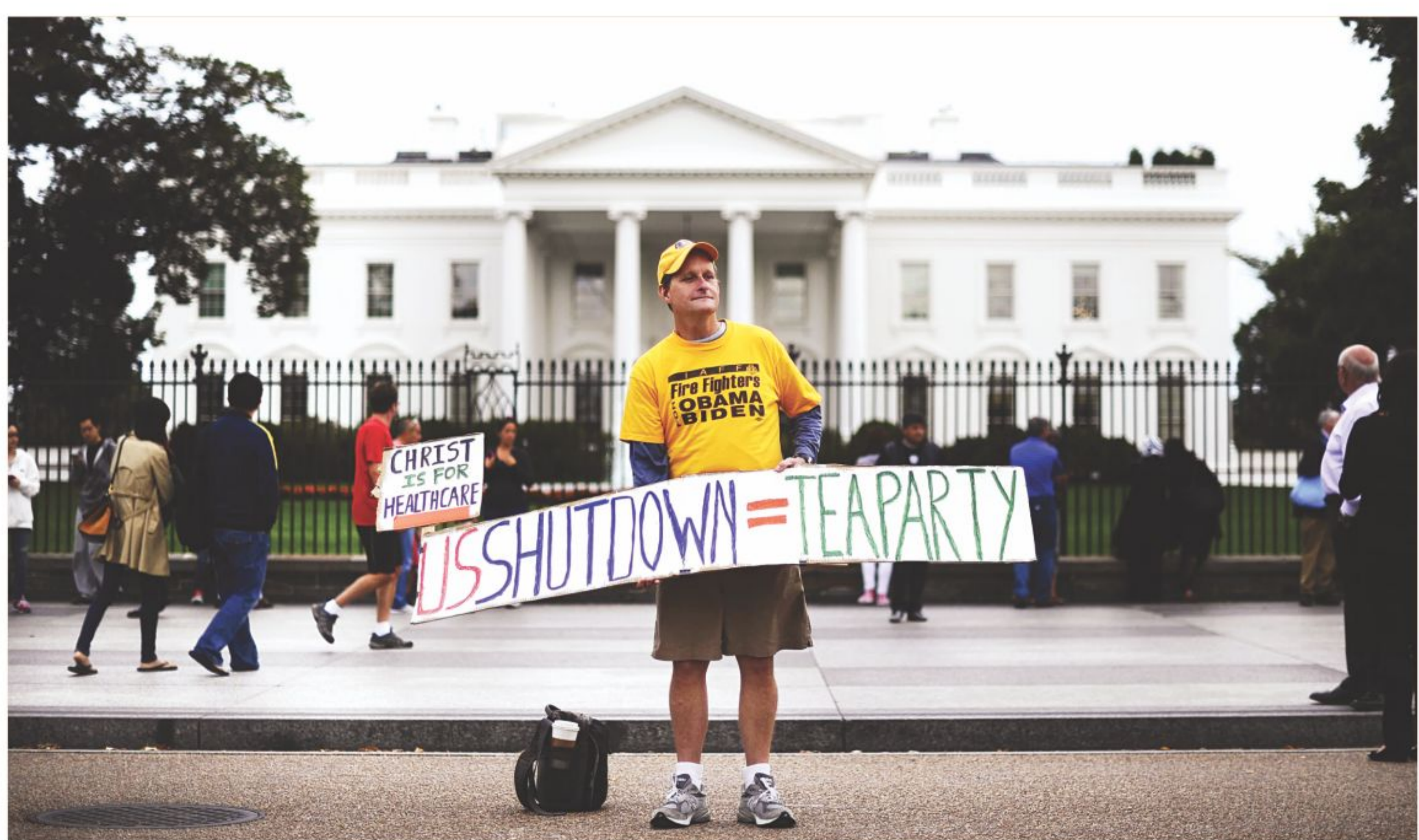
A lonely supporter of US President Barack Obama displays a placard in front of the White House in Washington, DC, yesterday, urging for the end of federal government shutdown. Obama Tuesday warned world leaders were nervous that Republicans would "blow up" the US economy, and vowed not to budge on his demand for the debt ceiling to be lifted without conditions.