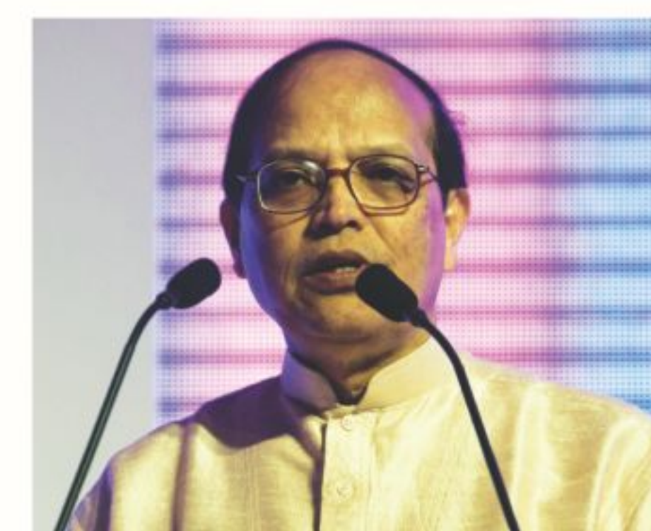
Dr Atiur Rahman

HSBC has been a friend of Bangladesh and by promoting this kind of inspirational events, they are contributing more to the future of Bangladesh. So, my heartfelt congratulations also to HSBC and all the partners.