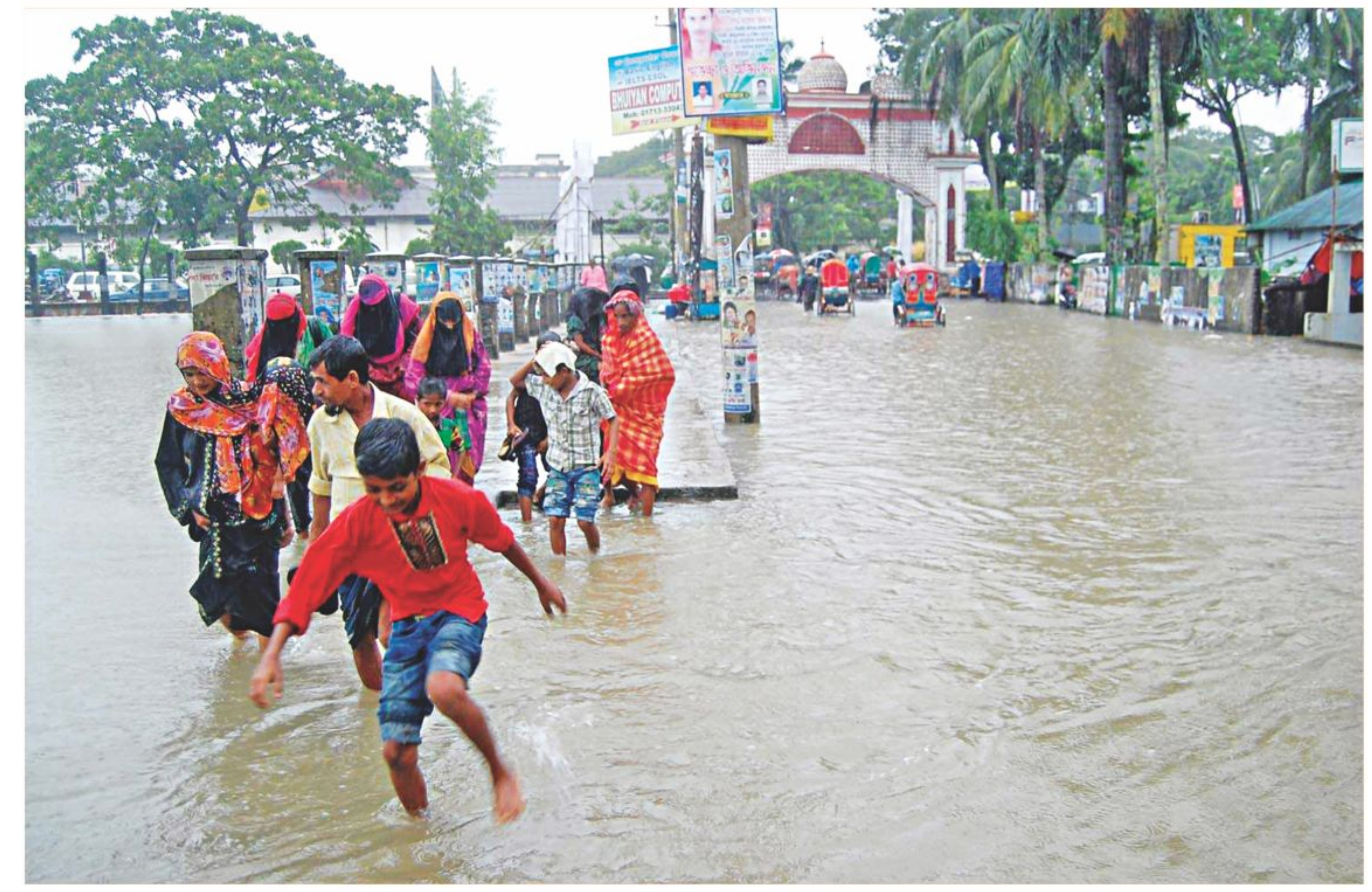
Dargah Gate area in Sylhet gets waterlogged after the city experienced this year's highest rainfall till date with over 247mm of rain yesterday.