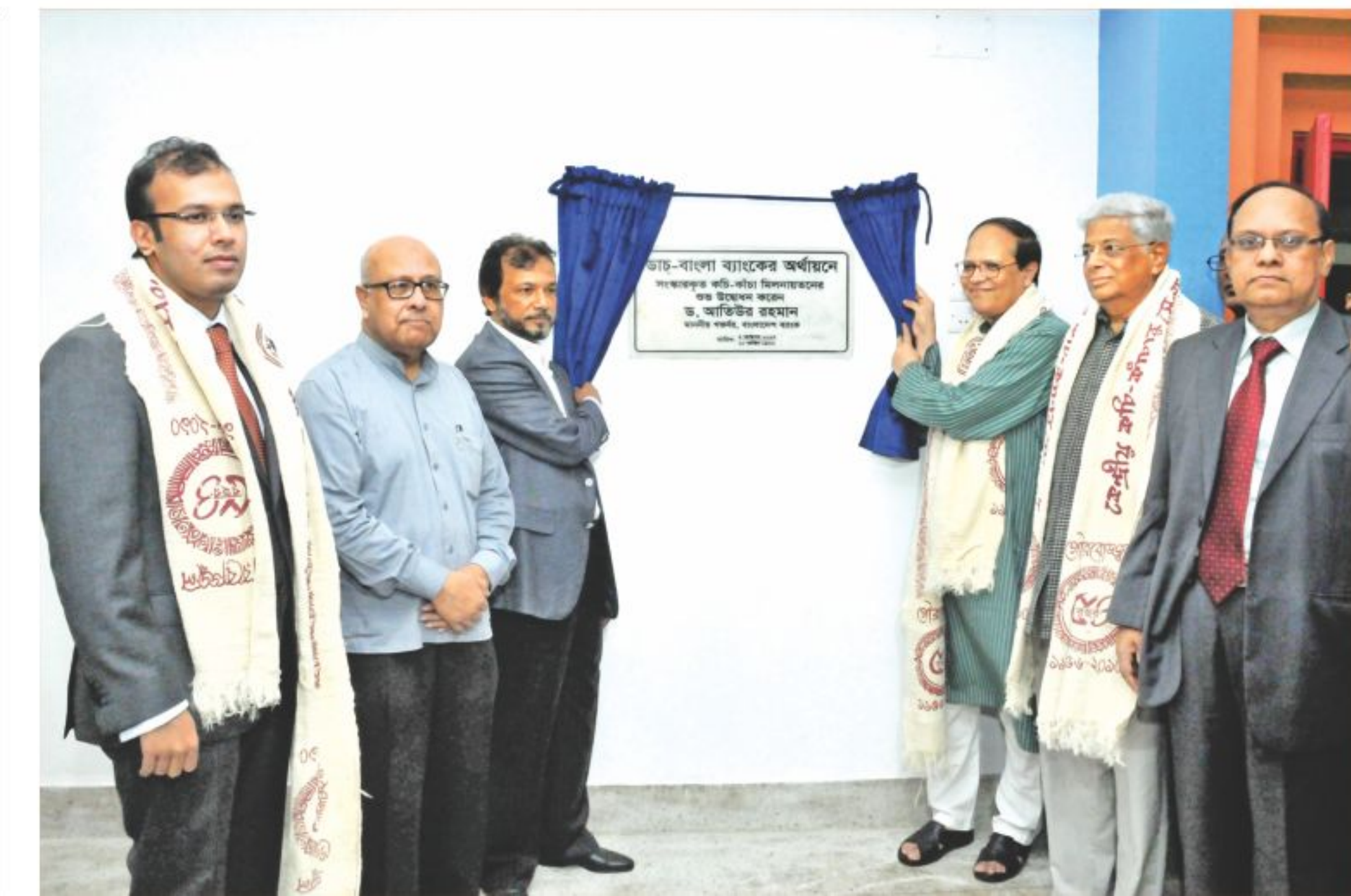
Bangladesh Bank Governor Dr Atiur Rahman, third from right, inaugurates the Tk 70 lakh-worth renovation works of Kendriya Kochi-Kanchar Mela's building, funded by Dutch-Bangla Bank, in the capital's Segunbagicha on Saturday.

Foreign Minister Dipu Moni yesterday said the world wants to hear about the unique development that Bangladesh managed to achieve despite having environmental challenges and a narrow economic base. "This has been possible due to our strong political commitment and close partnership that we forged with our NGOs, civil society, academics, media and development partners," he added. Addressing the certificate giving ceremony of Brainwiz Model UN Conference (MUN) at Dhaka University, she said some Bangladesh's development models are being replicated in other comparable settings. Brainwiz is a students' organisation to develop mainly academic and interpersonal skills. Dipu Moni mentioned that the "People's Empowerment and Development" model of the prime minister which was adopted by the UN last year as a viable proposition for international peace and development. She said Bangladesh's role in various fields, including the UN peace-keeping missions, disarmament, countering terrorism, combating trafficking and addressing climate change, are recognised globally.