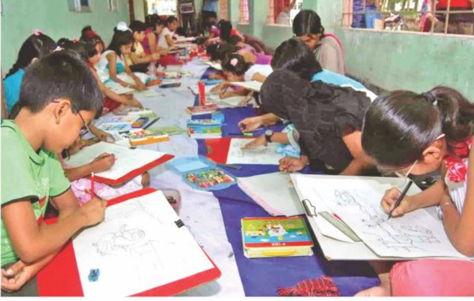
(Top) Artistes of Sandipon (Mymensingh) sing at the programme. Children participate in art competition marking Bogra Lekkhok Chakro's silver jubilee.