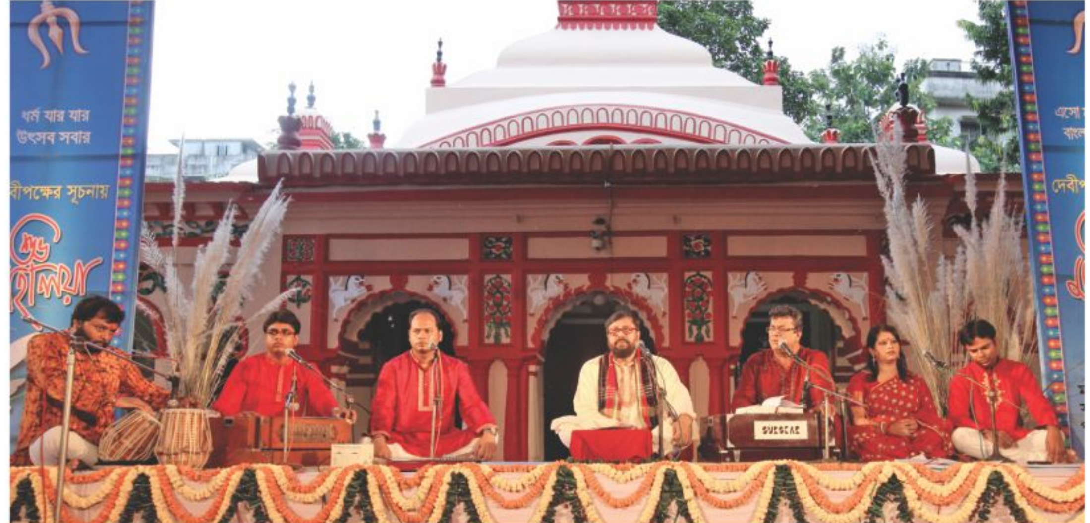
Artistes perform at the programme.