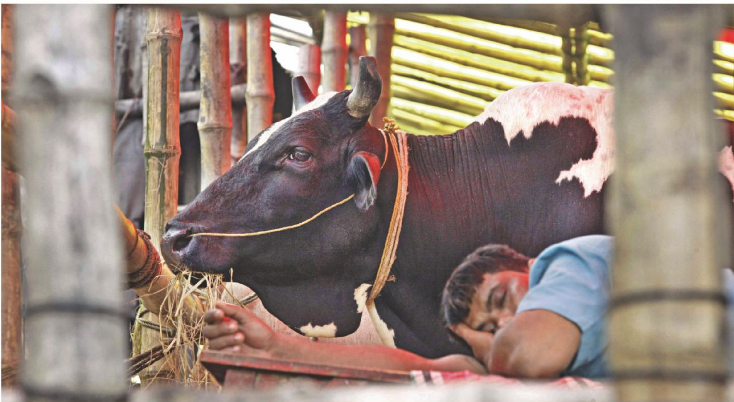
A worker takes a nap at Gabtali cattle market yesterday morning as trading of sacrificial animals is yet to get pace with nearly two weeks left to Eid-ul-Azha.