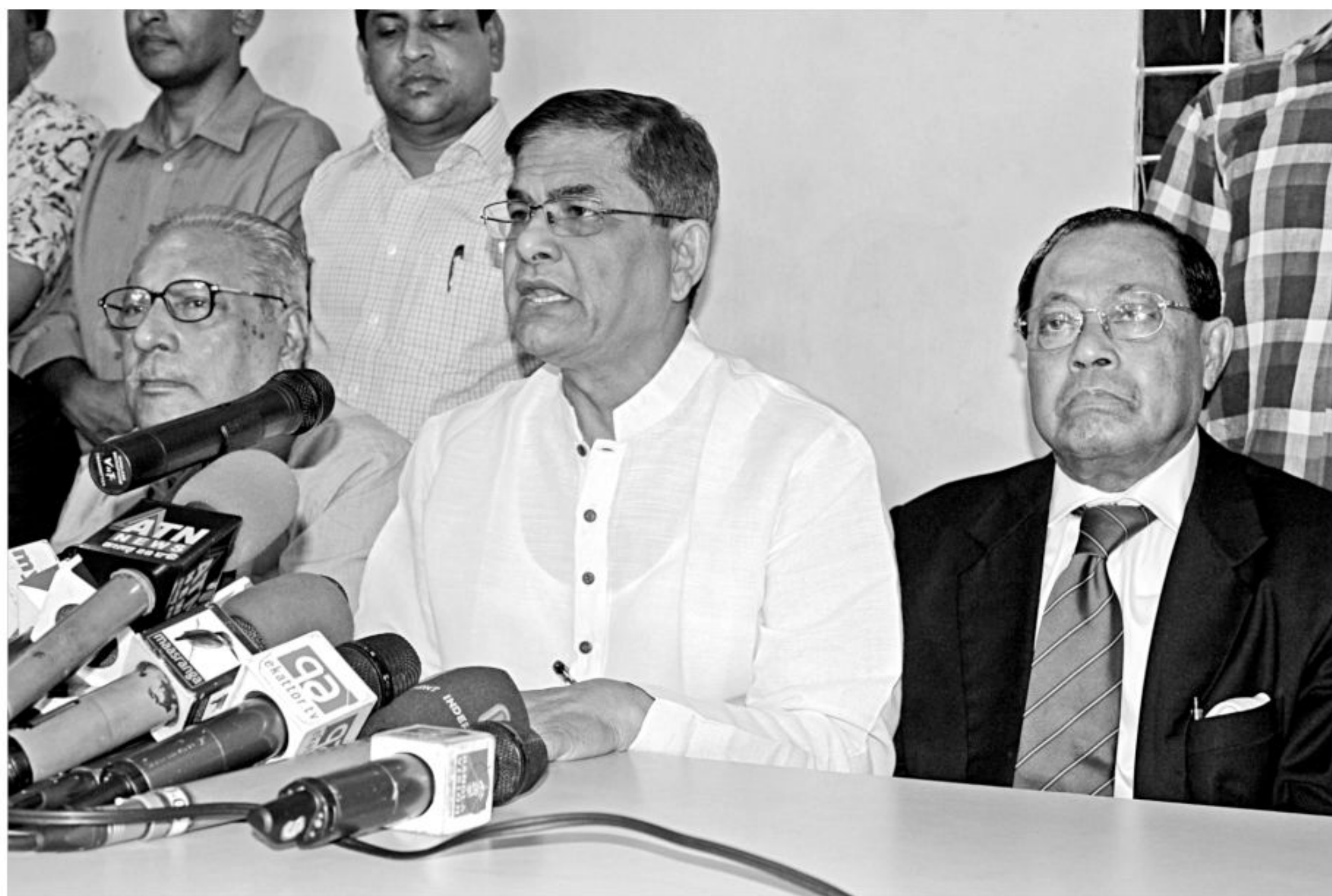
BNP acting secretary general Mirza Fakhru Islam Alamgir addresses a press conference at the party's Nayapaltan headquarters in the capital yesterday protesting the verdict against Salauddin Quader Chowdhury giving him death penalty for war crimes during the Liberation War in 1971.

Jail directorate sources informed that the ministry had been asked to raise the allowance.