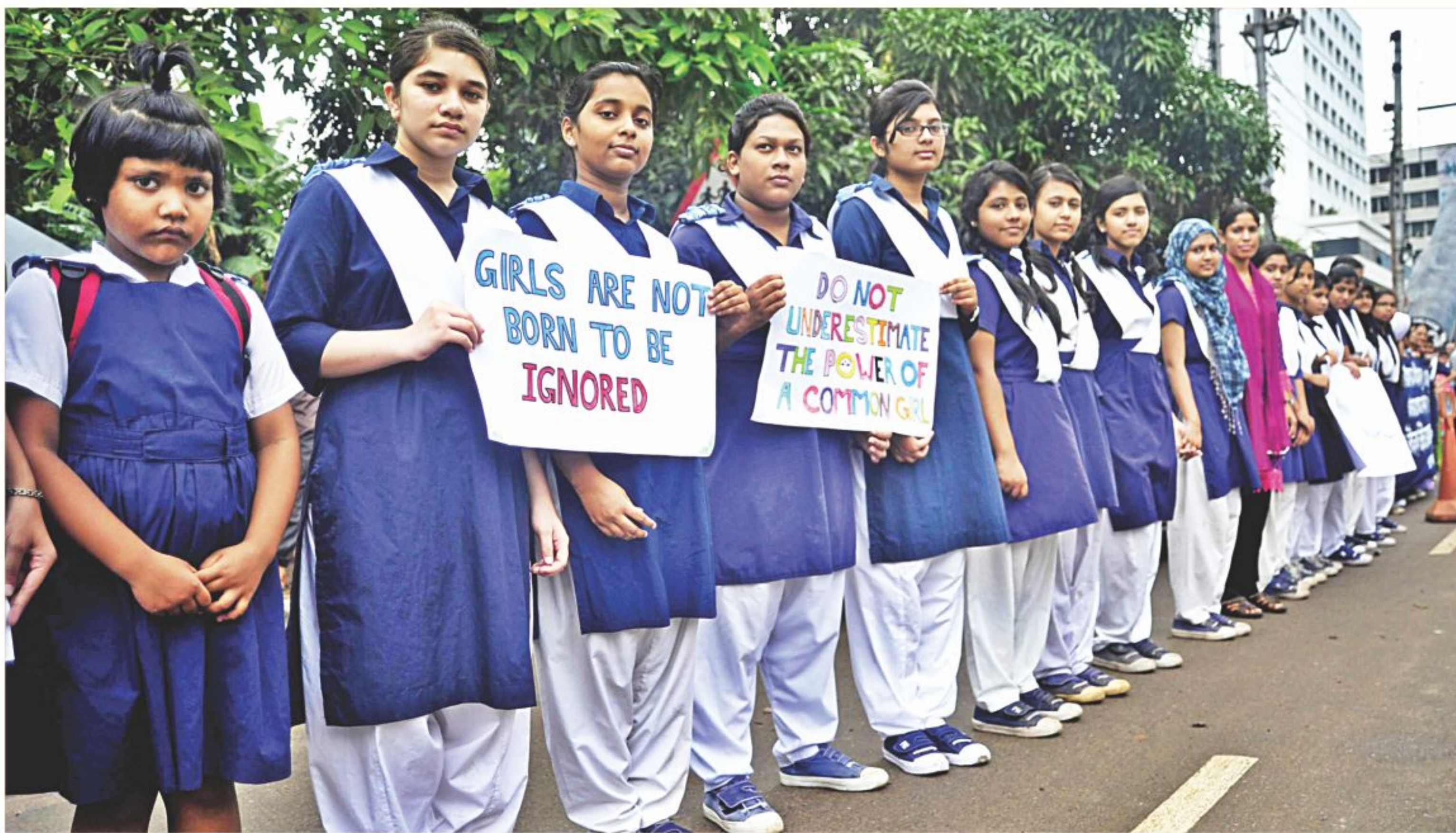
Students of Willes Little Flower School and College form a human chain before the school in the capital's Kakrail yesterday marking National Girl Child Day with the theme "Women's emancipation is not an impediment to religious practices and values, rather it complements those".

Organised by the Harvard Kennedy School, the conference is funded by the Department for International Development (DFID).