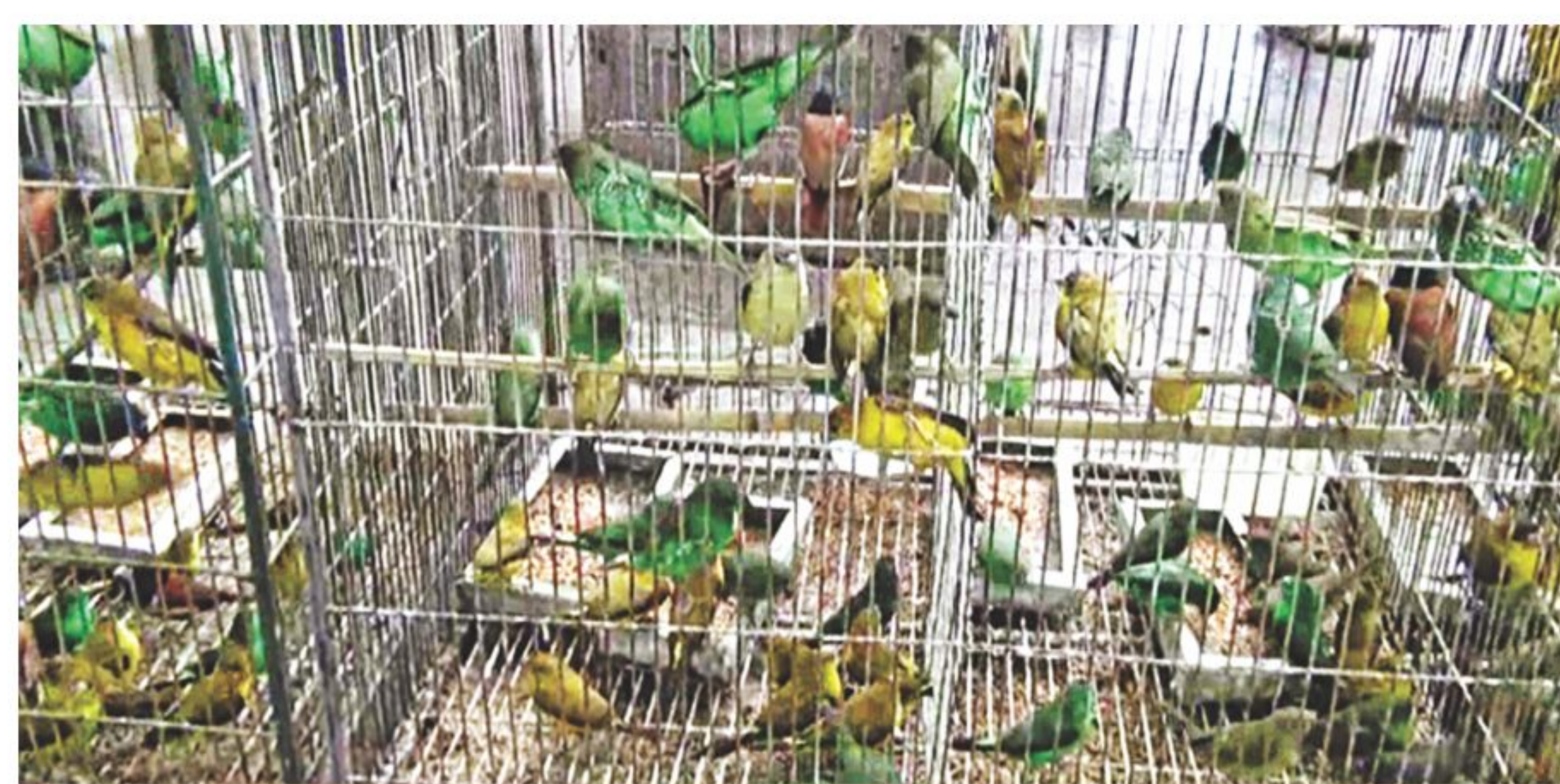
Some of the 444 birds rescued by Wildlife Management and Nature Conservation Division from a residence of illegal bird traders in Palerpara in Gazipur yesterday.