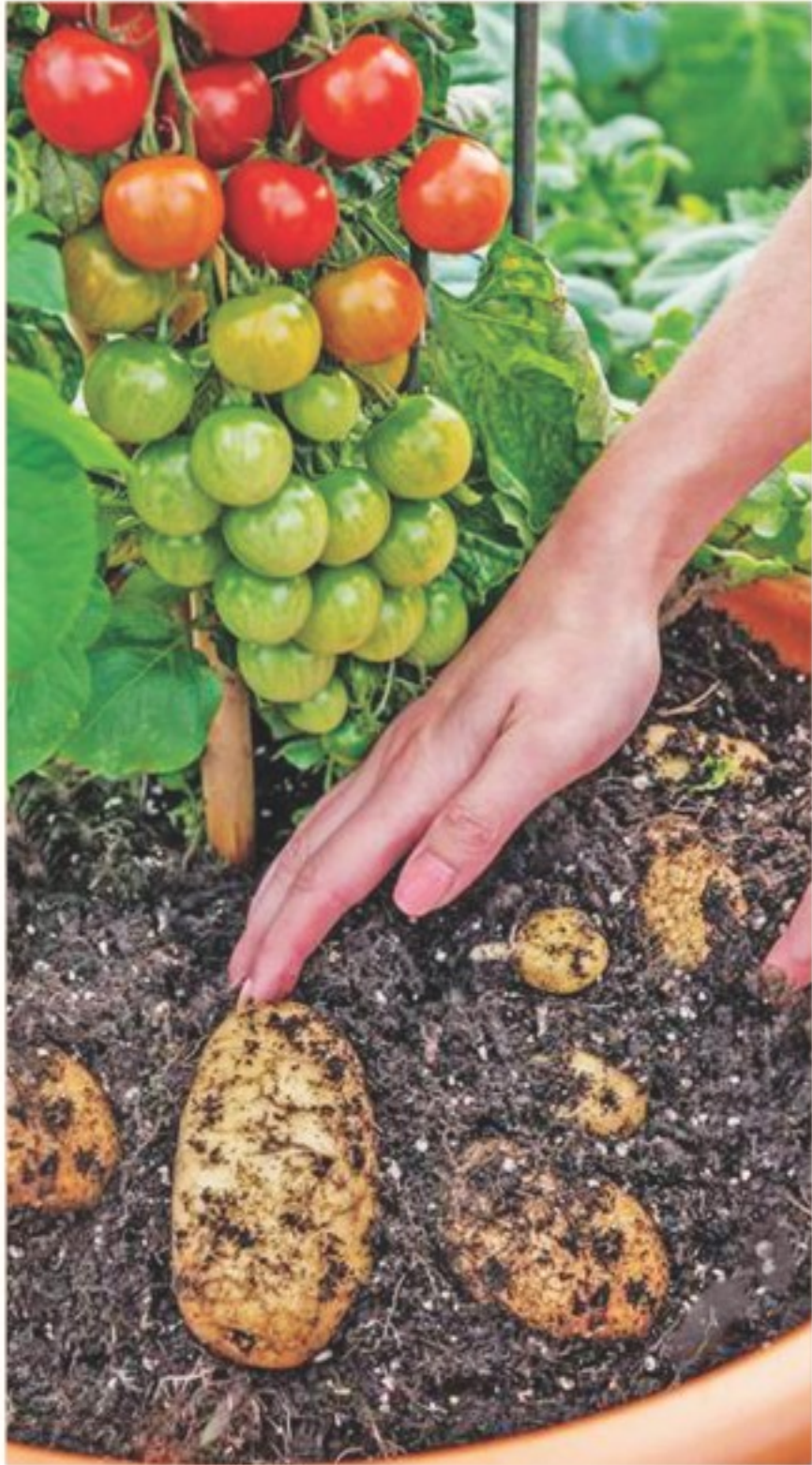
Incredible and yet true! It's a plant that produces both tomatoes and potatoes.