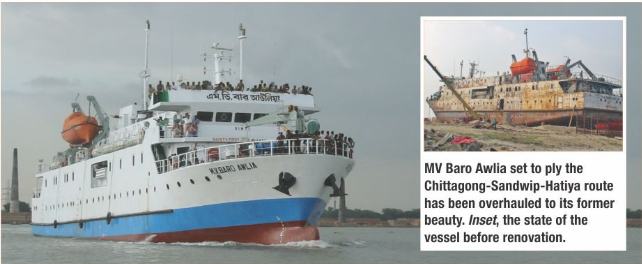
MV Baro Awlia set to ply the Chittagong-Sandwip-Hatiya route has been overhauled to its former beauty. Inset , the state of the vessel before renovation.

The coastal vessel ready to resume passenger services on Ctg-Hatiya route