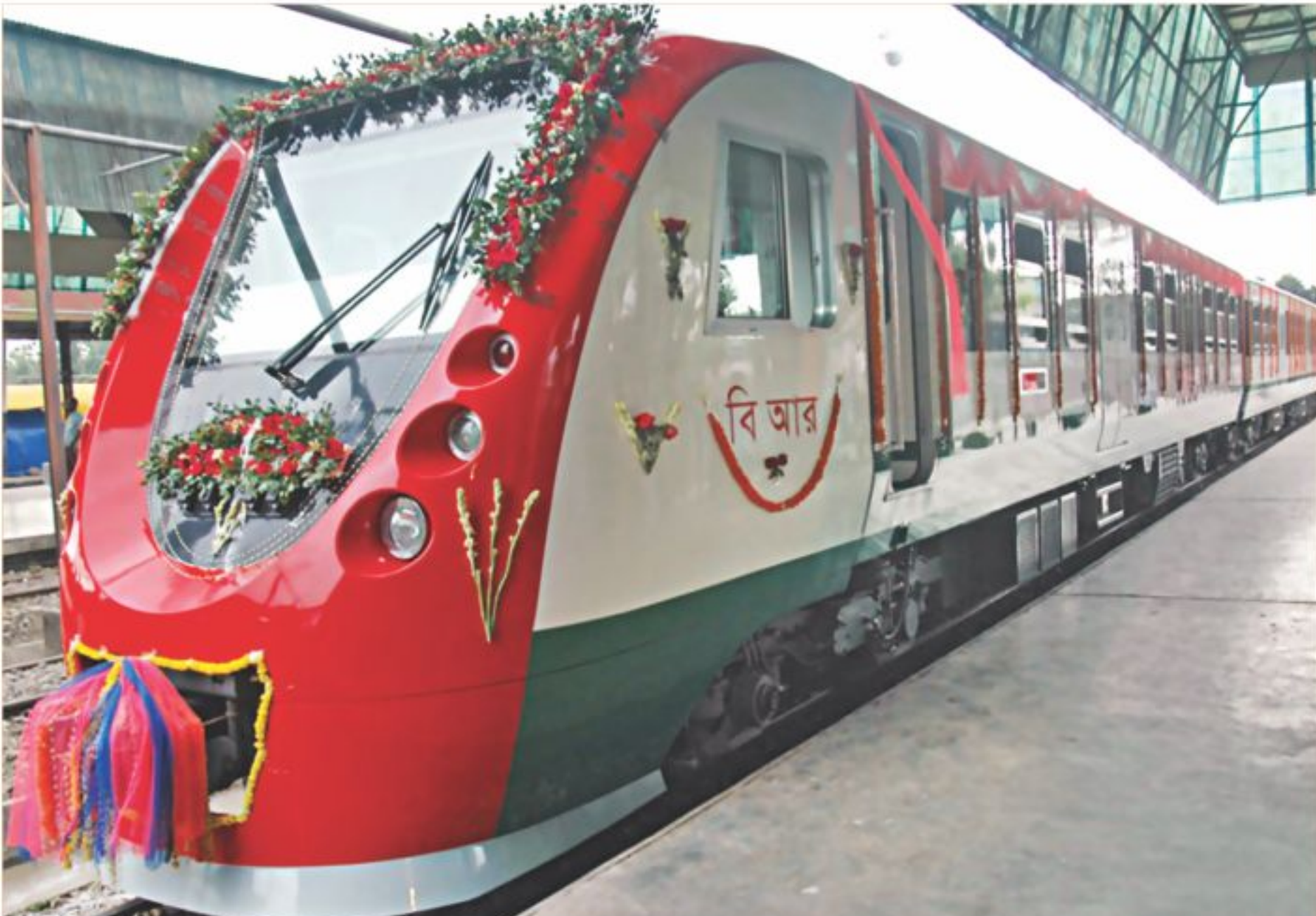
A Diesel Electric Multiple Unit (DEMU) commuter has been launched on Sylhet-Akhaura route yesterday. It will set off at 5:35am from Sylhet tomorrow to reach Akhaura at 11:50am and return to Sylhet at 21:55pm after starting at 15:30pm from Akhaura. Finance Minister AMA Muhith, not in picture , inaugurated the train at Sylhet Railway Station where Railways Minister Mazibul Hoque, not in picture , was also present.