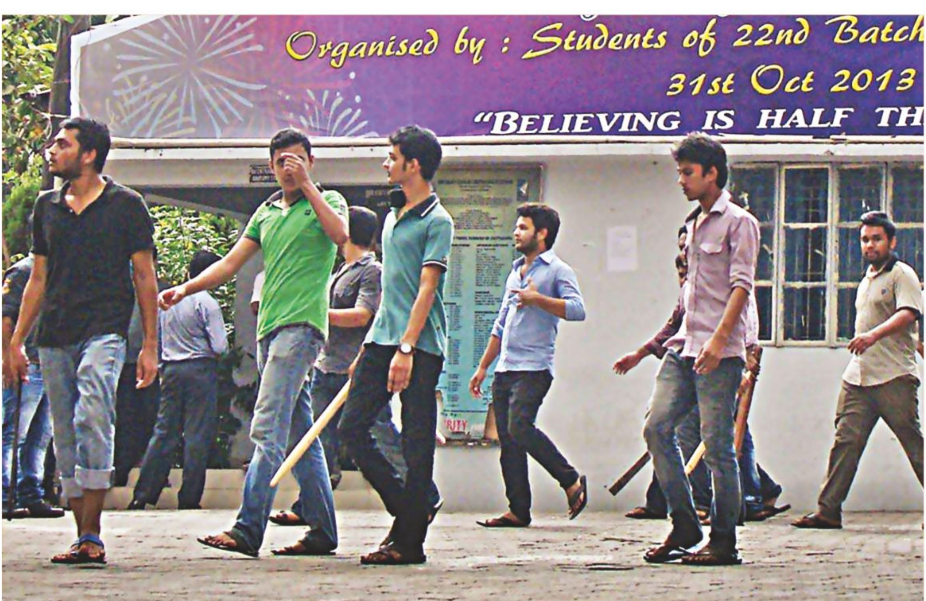
A group of BBA students armed with sticks takes position to clash with MBBS students, not in picture, at the University of Science and Technology Chittagong (USTC) in Chittagong city around 12:30pm yesterday. The violence was averted, as police drove both groups away from the campus around 2:00pm, and the university was declared closed indefinitely.